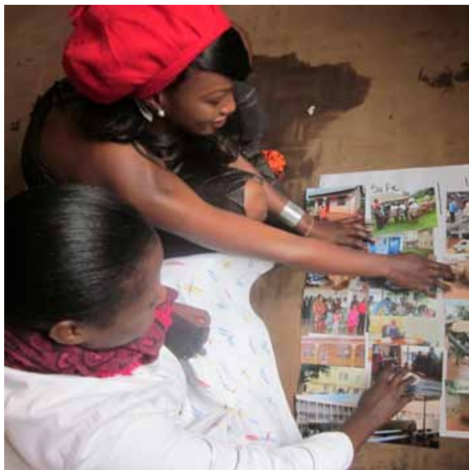
Data collectors re-creating the safety map as developed by group participants.