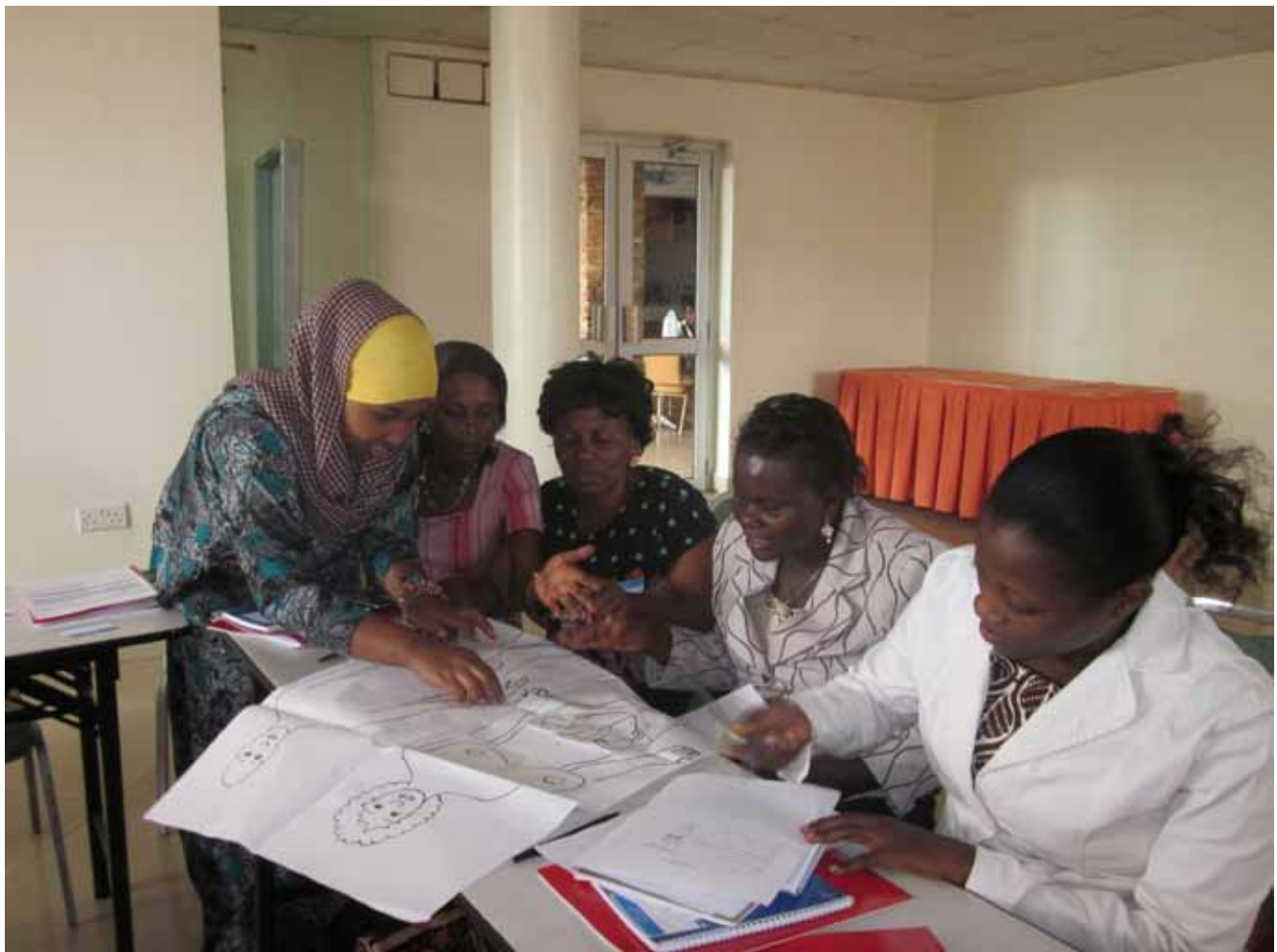
Data collectors practicing the body mapping exercise.