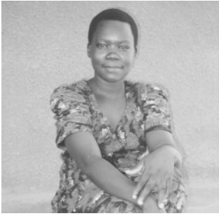
AFGHAN REFUGEE YOUTH