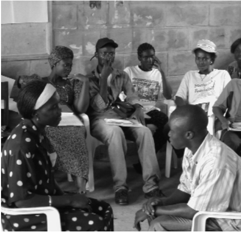
ADOLESCENTS IN SIERRA LEONE RESEARCH KEY NEEDS AND CONCERNS OF YOUNG PEOPLE