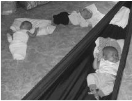
IDENTIFYING GAPS IN REPRODUCTIVE HEALTH