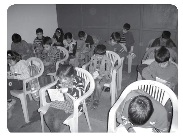
Afghan children learn English and Hindi in classes organized by the YMCA.

The Hindu Sikh Afghans are the best settled, least vulnerable of the refugee communities, although vulnerabilities still exist, especially among the widows and female-headed households. They live primarily in West Delhi, can afford higher rents and have established their own self-help association, called Khalsa Diwan. The association pays school fees for some of the 680