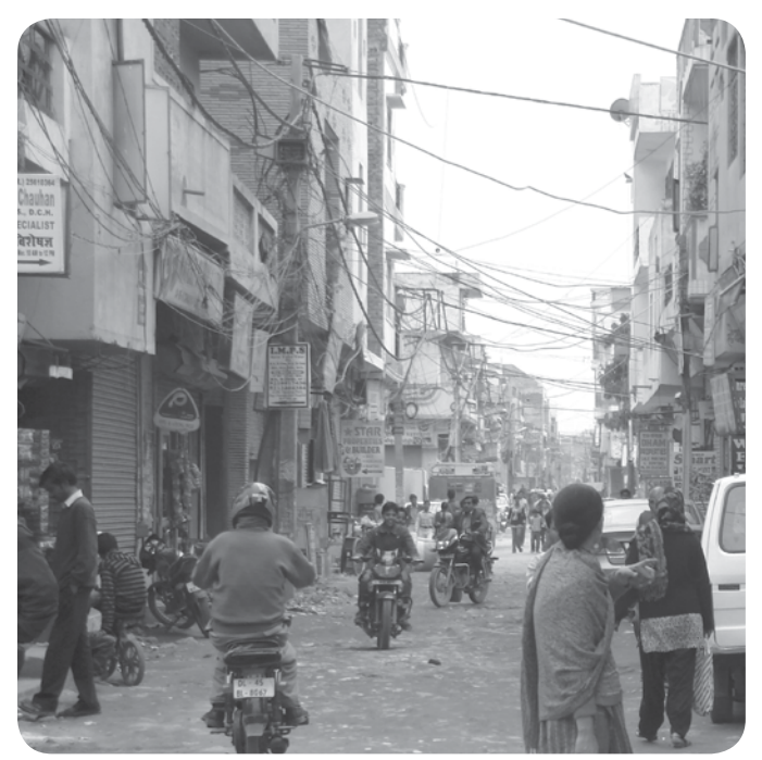
More than 50 percent of refugee now live in urban areas, many in poor neighborhoods such as this one in New Delhi.

More than 50 percent of all refugees now live in urban areas.4 While this trend is expected to continue, the models for providing protection and services to urban-based refugees are far less developed than those that exist for camp-based refugees, even though the latter represent only about one-third of UNHCR's current caseload.5 UNHCR's policy on refugee protection and solutions in urban areas, adopted in September 2009, recognizes that refugees should be allowed to live where they choose; that urban refugees are not necessarily young males who are able to provide for themselves; that refugees have diverse and compelling reasons to live outside of camps; and that fundamental to enhancing the urban protection environment is refugees' access to livelihoods.6 Operationalizing UN-HCR's policy document, however, requires a broader,