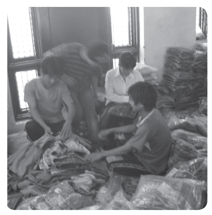
Many Burmese refugees work in irregular factories making knock-off name-brand jeans. Don Bosco monitors the factories to make sure refugees are not exploited.

"I like hiring the Burmese. They're hard working, dependable and nice. I'll hire more if my business grows."