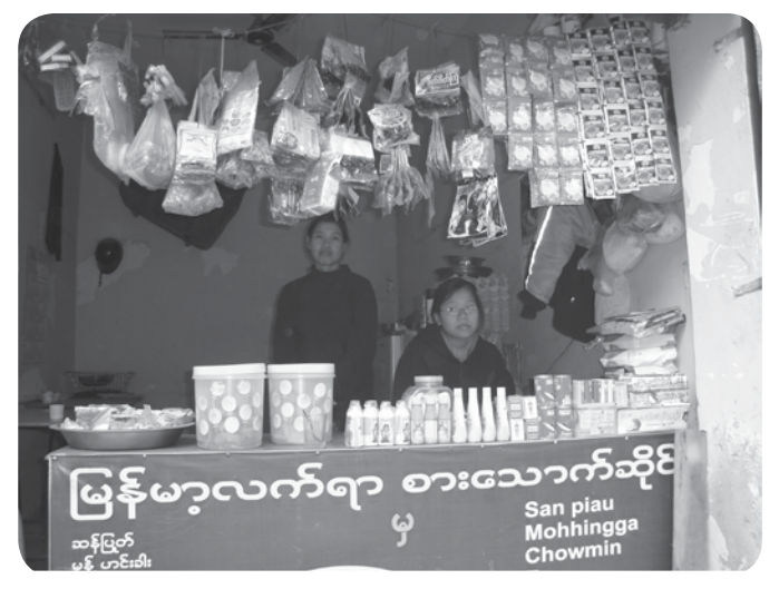
This Burmese woman runs a store with her daughter. Set up with a grant from DBA, the store has limited stocks and is struggling.

refugees usually double up on housing and generally have two or more income streams coming into the household. One family member, for example, may work in one of the factories while another may participate in the IGAs. In this way, they can bring in 6,000 to 7,000 rupees a month—which is considered the bare minimum needed to live.<sup>36</sup> Minimum wage in Delhi was raised by 15 percent on February 1, 2011 and ranges from 6,084 rupees per month for unskilled labor to 6,734 rupees for semi-skilled to 7,410 rupees for skilled labor and 8,060 rupees for college graduates.<sup>37</sup> According to multiple sources, the minimum wage is often ignored by employers, especially in the informal economy.