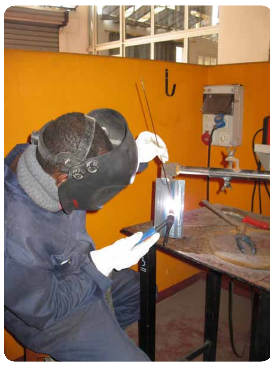
A refugee youth learns welding, a popular training option for work in the informal economy, at Don Bosco's Vocational Training Center.

Vocational training is needed and many youth interviewed requested access to this service; however, the availability, quality, timing and duration of vocational training needs to be improved. Training is currently offered through Caritas, which subgrants to 17 institutions across Cairo; however, only one institute was rated as effective by the people WRC spoke to. Don Bosco is the preferred training institute for Egyptian as