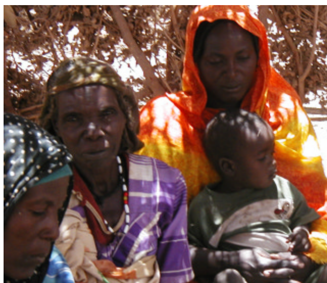
Midwives at Adré.