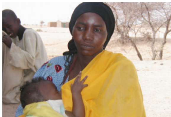
Mother and child in Amnabak.

The first prong was completed in 2003 and a report completed. The current report addresses the second element of the evaluation for Component 4.