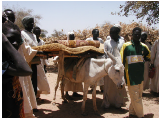
Donkeys are sometimes used to transport women who are experiencing problems in childbirth.