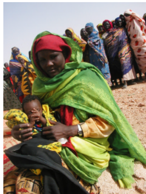
Women gave birth on the roadside, such as this woman near Tine.