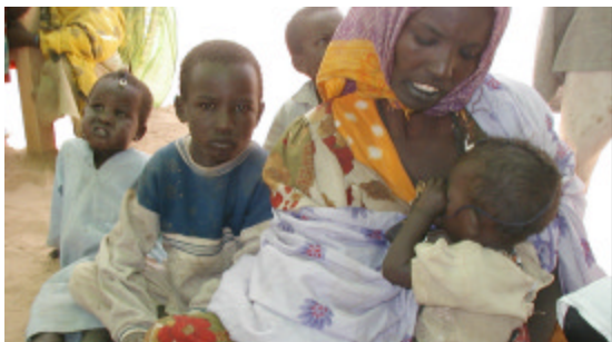
Refugee woman and children at the Iridimi refugee camp.

We have asked questions about HIV several times and they really don’t know HIV/AIDS