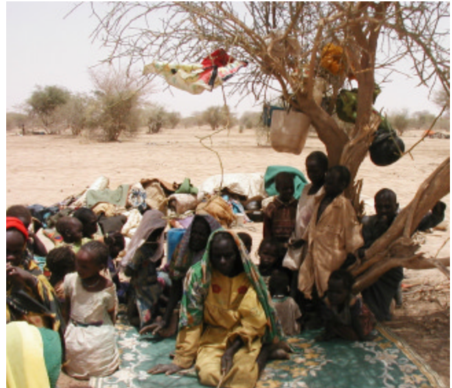
New arrivals from Darfur at Bahai, Chad.

Women and girls have been directly targeted for violence in Sudan. Attacks by the Janjaweed have resulted in widespread sexual violence towards women and girls searching for water, food and firewood in Darfur. Thousands of these displaced women are pregnant and nursing, with little access to health care services. 14