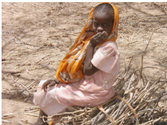
Girl collecting wood in Touloum.

UNFPA submitted a proposal to the United Nations Consolidated Appeals Process (CAP) with a planned launch on April 10. The proposal included funding for a full-time RH coordinator, training and planning for the future. However, the CAP has not been well funded so far and in addition, there must be another mechanism to ensure funds are available at the start of the emergency. One international NGO submitted four proposals integrating the MISP with primary health care to different donors and all were pending a response during the assessment team’s visit. This situation highlights the obstacle of funding to implementing MISP activities; agencies must react swiftly in emergencies and need to have readily available funds to do so.