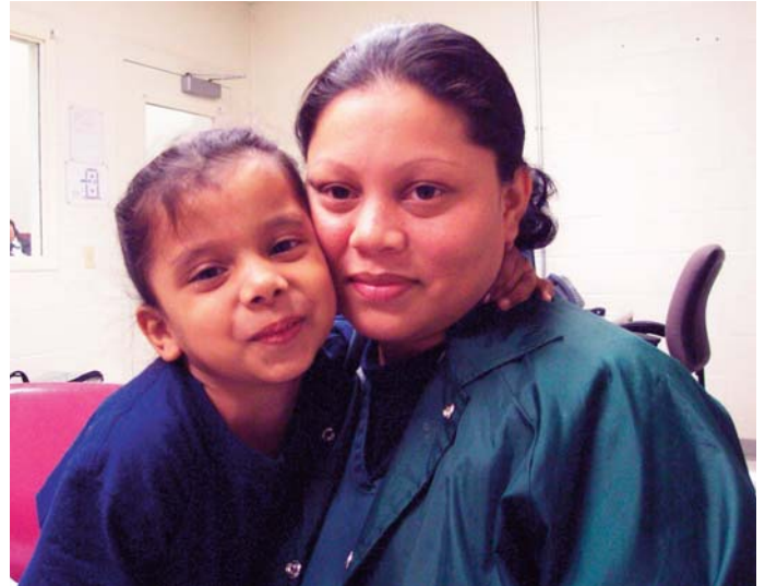
Women and their children are held in the T. Don Hutto Family Residential Center, a former prison in Texas, while they await a decision on their asylum case.

Nearly 9,000 unaccompanied children were held in immigration custody in 2007—more than ever before. Many of these children escaped human rights abuses, including prostitution, child labor, abandonment, abusive families, forced military recruitment or forced marriage.