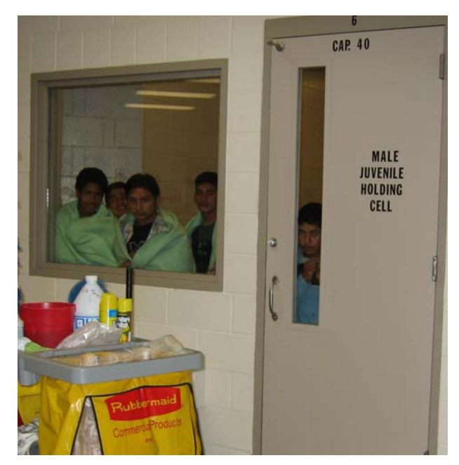
Boys held in a cell at the Border Patrol's Fort Brown (Texas) station.

inal backgrounds that would justify ICE's retention of custody over these children.<sup>45</sup> Custody of unaccompanied children with criminal convictions was further clarified by the TVPRA, which provides that unaccompanied children charged with having committed a criminal offense should be in DUCS custody, and may be placed in a secure DUCS facility.