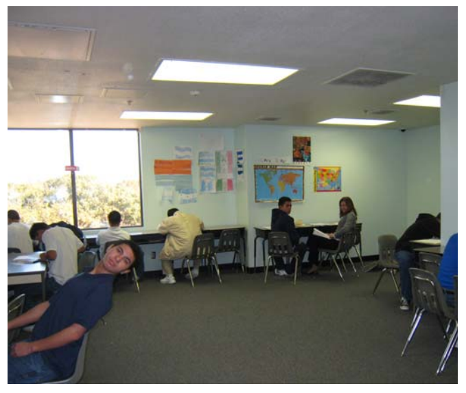
The quality—and quantity—of education varies between DUCS program sites. Here, children study at the Abraxas Hector Garza Center in San Antonio, Texas.

training or vocational training. Many of the children expressed a desire for more English language instruction. In addition, most facilities lacked age-appropriate books or magazines for children in their native languages.