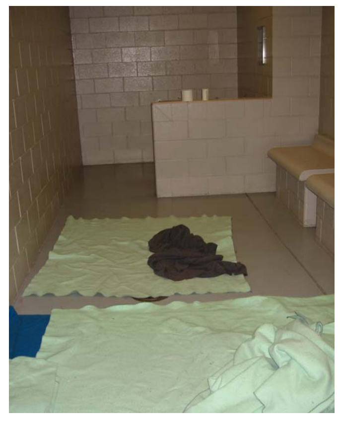
Children held at the Fort Brown Border Patrol facility sleep on cold floors, with minimal bedding.

There are no appropriate sleeping accommodations for children in Border Patrol stations. Like adults, children sleep on cold floors, thin mats, plastic sheets, cement benches, newspaper or plastic "boat beds." At El Paso and Ft. Brown, most children are provided with blankets, but at the Harlingen substation children received no blankets at all. When we asked why they had none, agents told us that the station used to provide them, but that the blankets became infested with bugs because the children were so dirty. The blankets were discarded. Children at stations where blankets are provided confirmed that the blankets were dirty; one child stated that she did not use the blanket she was given because it had bugs on it. 65