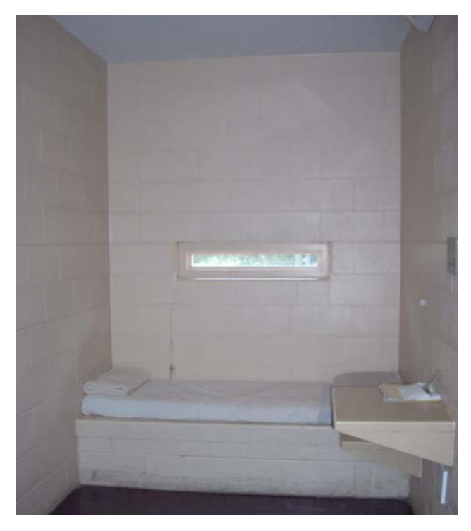
A bedroom at the Southwest Indiana Regional Youth Village (Vincennes), Indiana, is reminiscent of a prison cell.

The problem of these larger, more impersonal facilities and their impact on safety and care is particularly pronounced in staff-secure and secure facilities. (See Appendix F for definition of secure and staff-secure facilities.) In the year we conducted most of our field research, 108 DUCS opened new secure and staff-secure facilities. In part this was a response to the growing number of children referred to DHS from law enforcement. 109 However, DUCS increasingly places children with behavioral and mental health problems in staff-secure and secure facilities, rather than therapeutic programs. Many of these facilities do not yet have adequate staffing in place to handle the increased population, prompting concerns from staff and attorneys about the facilities' ability to meet the complex needs of the children.110 At the time of our visit to the Northern Virginia Juvenile Detention Home (NOVA) in Alexandria, Virginia, the facility had no daily staff members on site who were trained in DUCS policies and procedures.111 Rapid population growth seems to have contributed to abuses that developed at both the