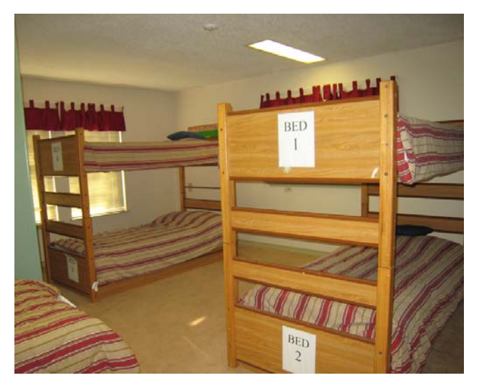
A bedroom at the Baptist Child and Family Services (BCFS) shelter, an ORR facility, in San Antonio, Texas, has a more dorm-like feel.

DUCS uses a range of facilities from foster care, to group homes, shelters, staff-secure and secure facilities for the placement of children. (See Appendix F for additional information.) While DUCS has expanded the use of foster care and decreased the use of secure facilities (discontinuing agreements with 31 secure acilities used by the former INS),133 a lack of clarity and consistency in placement decisions has sometimes resulted in an overuse of staff-secure and secure facilities. Some staff-secure and, particularly, secure facilities are, or closely resemble, juvenile correctional facilities, and are characterized by constant observation from staff and increased structural security. Staff-secure and secure facilities are wholly inappropriate for most<sup>134</sup> unaccompanied children because they are based on a correctional, not a child-welfare, service model and