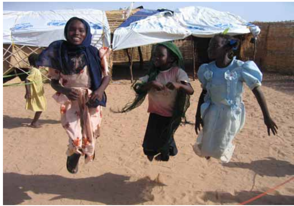
Women's Commission for Refugee Women and Children