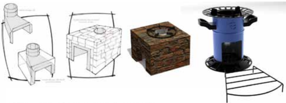
ENVIROFIT INTERNATIONAL - (Left) Schematic and rendering of Envirofit BUILT-IN COOKSTOVE prototype, (Right) Preliminary rendering of Envirofit LOW-COST COOKSTOVE prototype