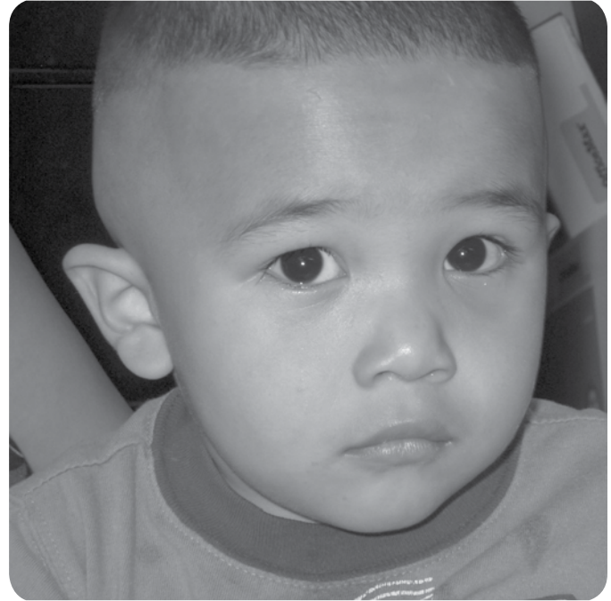
Children separated from parents who are in immigration detention or have been deported may end up in foster care or with unknown relatives.

In addition to undermining the well-being of children and families, the absence of clear and appropriate guidelines creates a lack of consistency and a great deal of confusion on the part of ICE agents. Some ICE agents use their discretion to not detain parents based on their concerns about children who may be left