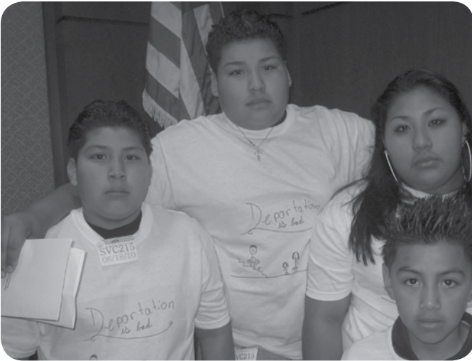
Countless children live with the trauma of separation from detained or deported immigrant parents.

unnecessarily vulnerable positions and can create de facto permanent separation. ICE has the capacity to arrange for family reunification prior to deportation, and can arrange for transportation of families on commercial carriers when necessary.