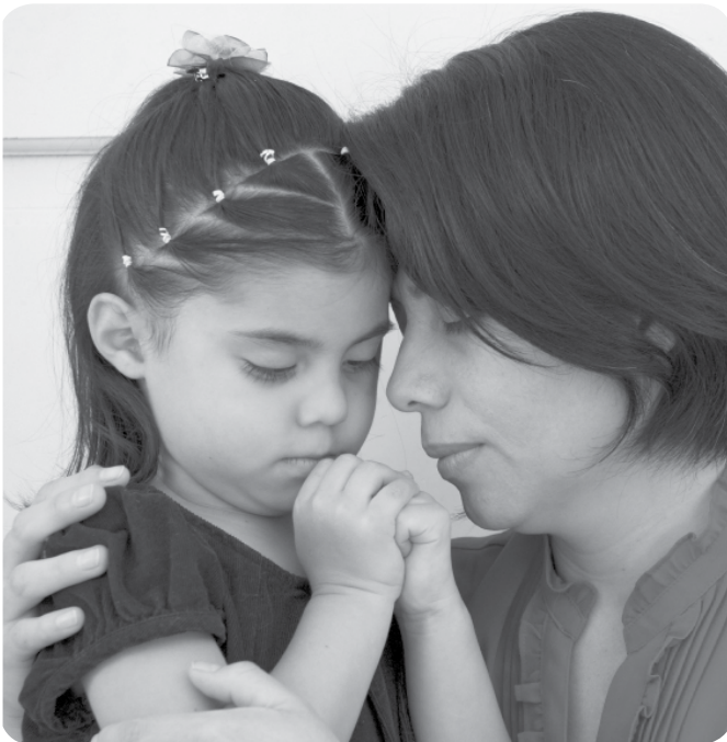
Immigrant mothers and their U.S. citizen children are often separated when parents are deported.

This report will focus on infringement on parental rights as a result of immigration enforcement, detention and deportation as well as on the collateral damage our current immigration practices cause for parents and children. 21 Our recommendations focus on preserving family unity—a founding principle of U.S. immigration