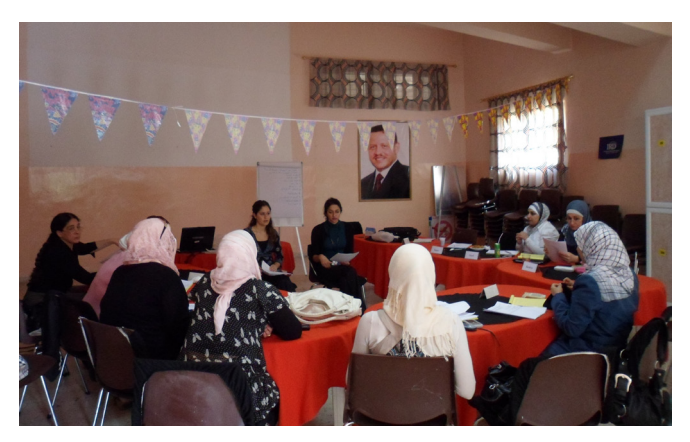
Training of household survey interviewers.

We visited Jordan to examine the extent to which Iraqi refugees use family planning services in Amman. We wanted to learn about what the Iraqi people think about family planning and whether they are able to obtain contraceptives; how many people use them; and what family planning services are available to them in health facilities.