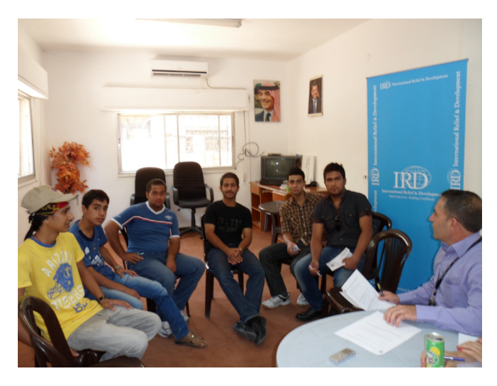
Adolescent focus group discussion.