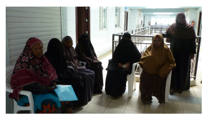
Women preparing for a group discussion about family planning in the community, July 2011.

We visited Kenya to examine the extent to which Somali