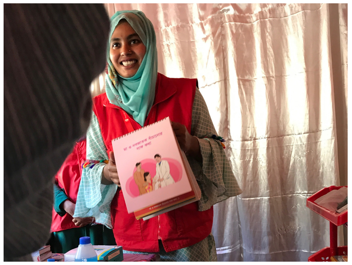
A Save the Children health worker at a health post in Kutupalong camp, Cox's Bazar, Bangladesh.