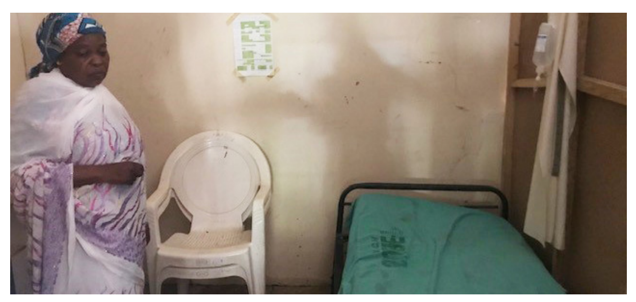
The head of family planning in the procedure room at the clinic in Mogcolis, Borno State, Nigeria.