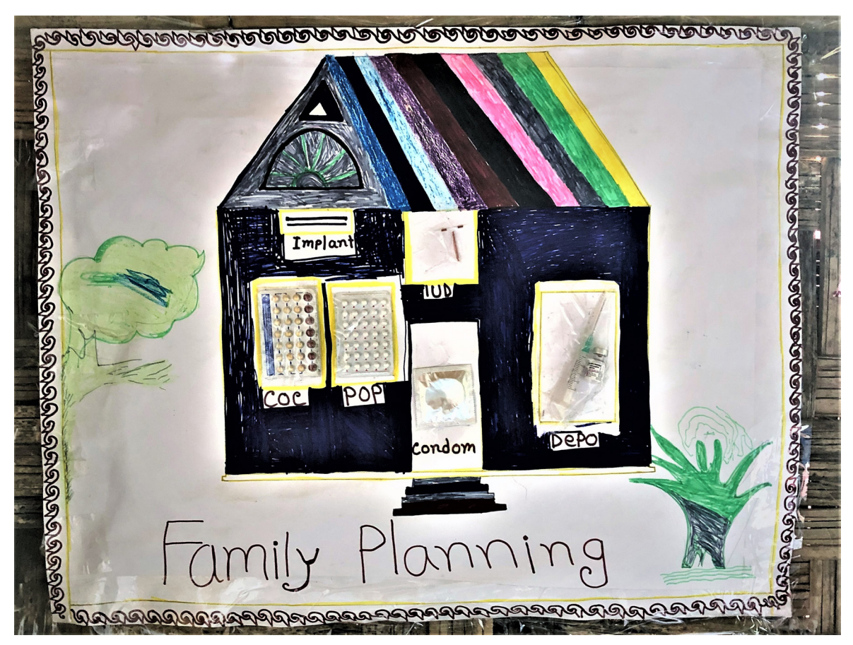
Illustration seen in an IRC midwife room in a women-friendly space, Ukhiya camp, Cox's Bazar, Bangladesh.

Addressing these key gaps will lead to significant improvements in contraceptive access in humanitarian settings and across the humanitarian-development nexus, improving the health and autonomy of women, girls, and others affected by crises.