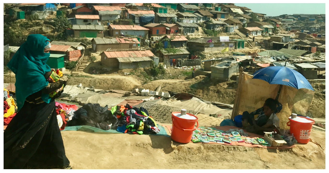
View of Kutupalong camp, Cox's Bazar, Bangladesh.

16 World Health Organization, WHO Consolidated Guideline on Self-Care Interventions for Health. Sexual and Reproductive Health and Rights (2019), <u>https://www.who.int/reproductivehealth/publications/self-care-interventions/en</u>.