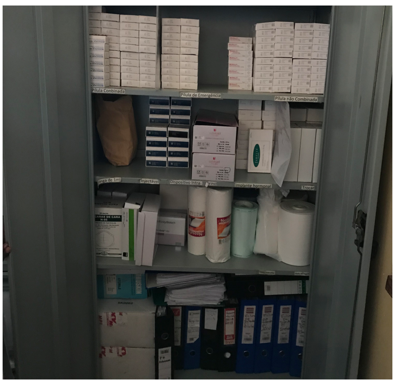
Contraceptive supplies in a health center, Mozambique.