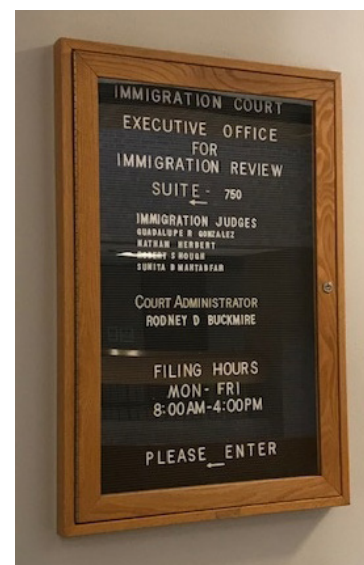
"El Paso Immigration Court"

WRC remains extremely concerned that RIM is being applied to vulnerable populations, such as young children, families, and persons with documented health issues. As a part of RIM, Customs and Border Protection (CBP) is once again separating families in even more dangerous and devastating circumstances than in the past.