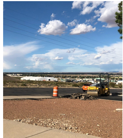
“Temporary CBP tent facility outside the El Paso Border Patrol station”