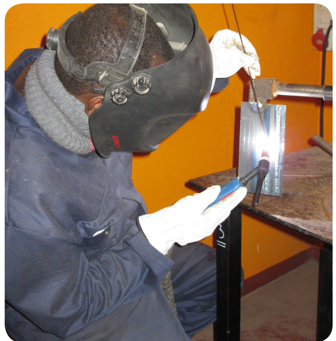
A refugee youth learns welding, a popular training option for work in the informal economy, at Don Bosco's Vocational Training Center.

Though humanitarian agencies may recognize the importance of youth participation in program design, management, monitoring and evaluation, few manage to implement such an approach. Participatory programs are labor intensive for service providers, and adult decision-makers rarely consult or engage youth in a systematic