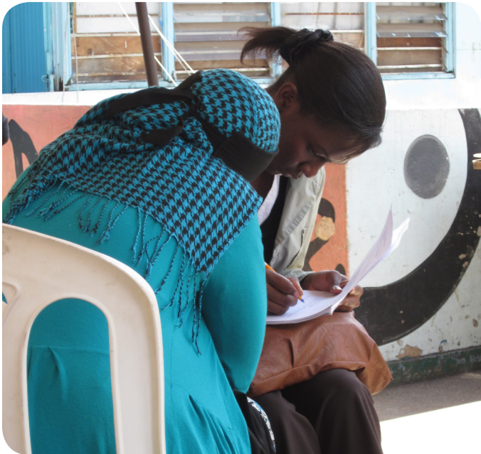
A research team member interviews a young woman refugee from Somalia in Nairobi.