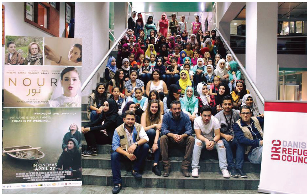
More than 250 girls, 120 female caregivers, 60 boys and 40 male caregivers graduated from DRC's Empowering Adolescent Girls project in Tripoli, Lebanon, in collaboration with the Women Refugee Commission and with funding from UN OCHA.

Sr. Program Officer, Adolescents in Emergencies | Women's Refugee Commission