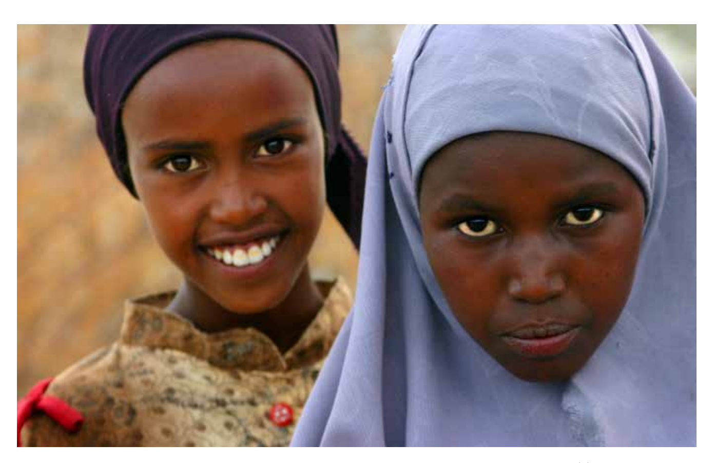
"Sunny and Serious Awbare Girls," Somali girls in Ethiopia