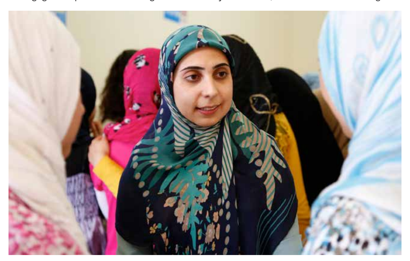
A Lebanese teacher talks to two Syrian refugee girls at an information session about gender-based violence and early marriage in southern Lebanon.

Young girls expressed a strong desire to stay in school, and saw child marriage as