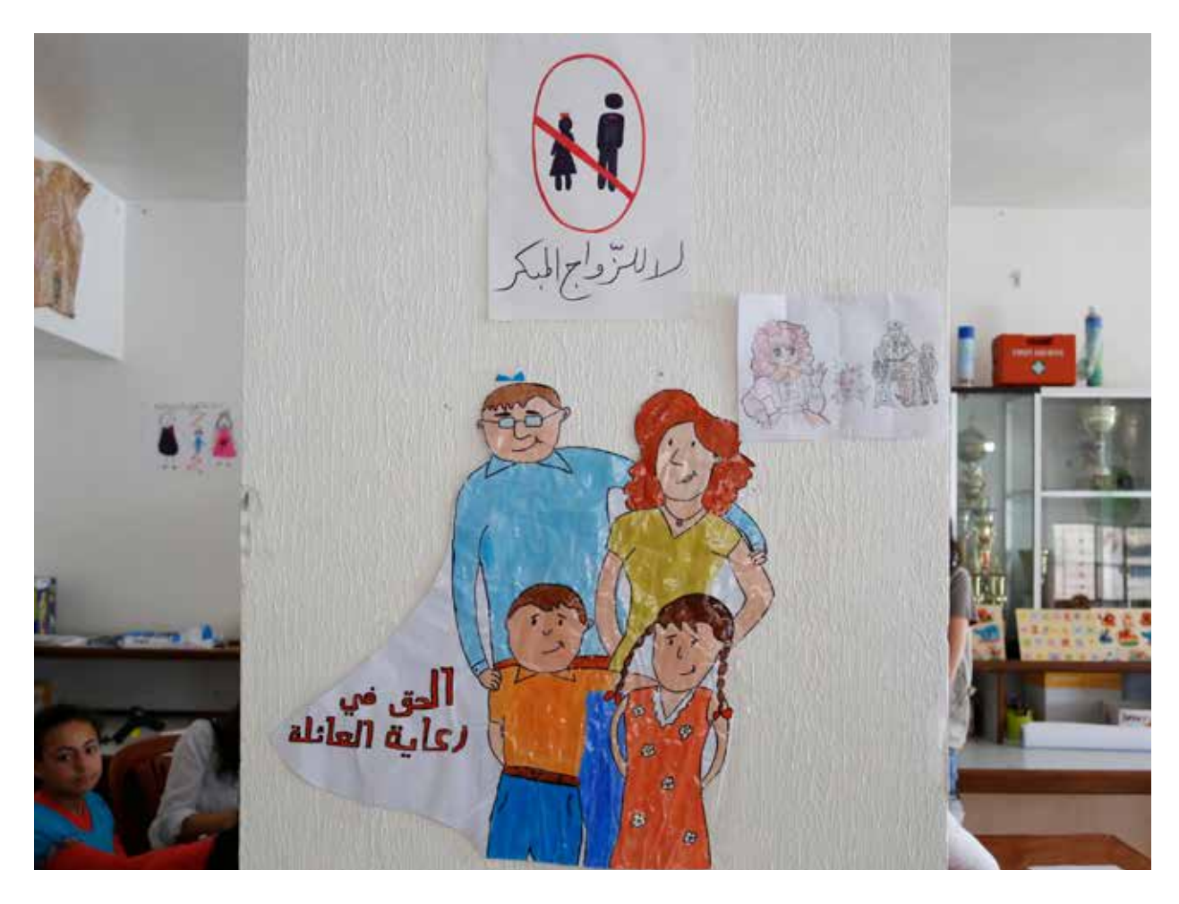
Drawings by young Syrian refugee girls in a community center in southern Lebanon promote the prevention of child marriage.