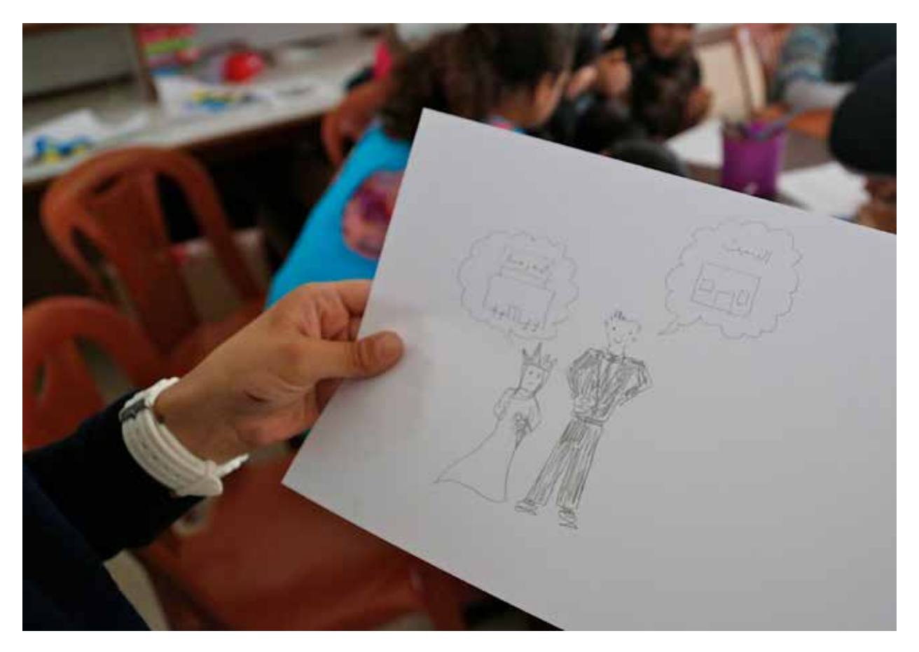
A girl holds up a drawing of a bride and groom during a discussion about child marriage with teenage Syrian refugee girls in a community center in southern Lebanon.

Evaluation research has identified promising interventions, but research is lacking on how these can be integrated within emergency response. In humanitarian contexts, approaches to preventing and responding to child marriage should be piloted and specifically monitored for child marriage outcomes, including: skills and asset building of adolescent girls; parent and community education; economic interventions for household self-reliance; improving access to education; and outreach strategies to married girls inclusive of comprehensive health and livelihoods programming. Multisector approaches to address child marriage, as a form of GBV, could also be piloted during the roll-out of the IASC GBV Guidelines.