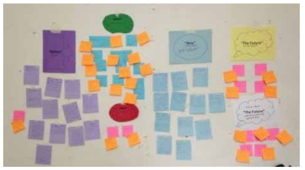
Participatory activity with GBV practitioners - Capacity on disability inclusion "Before", "Now" and "The future."