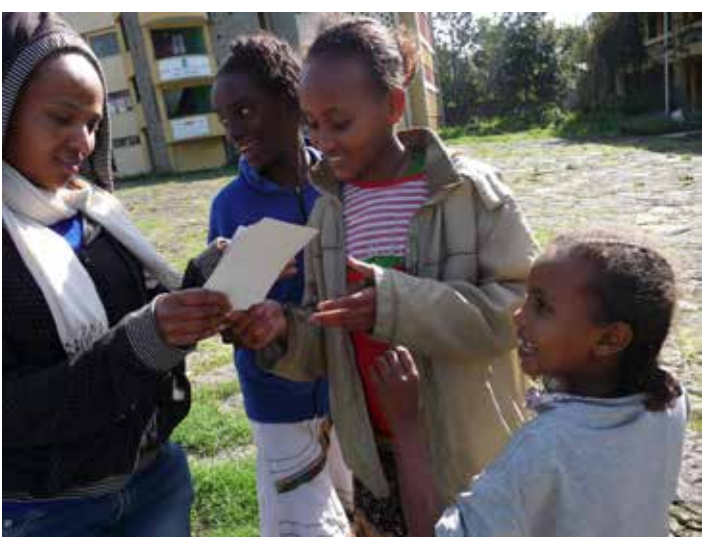
Girls with disabilities share with older girls their photos that they took.