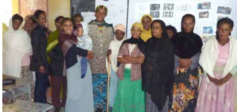
Group discussions with young women who are caregivers of persons with disabilities, and mothers of children with disabilities.