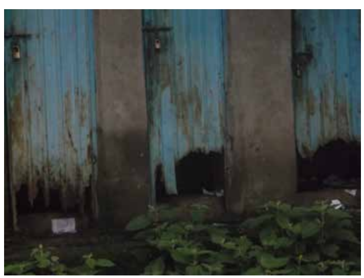
Girls took photos of the toilets. This is a place where girls with and without disabilities feel unsafe and may experience sexual violence. They are also not accessible for girls with movement