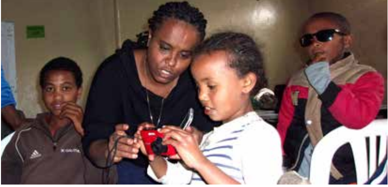
Practicing with tools from the Communication Toolbox.