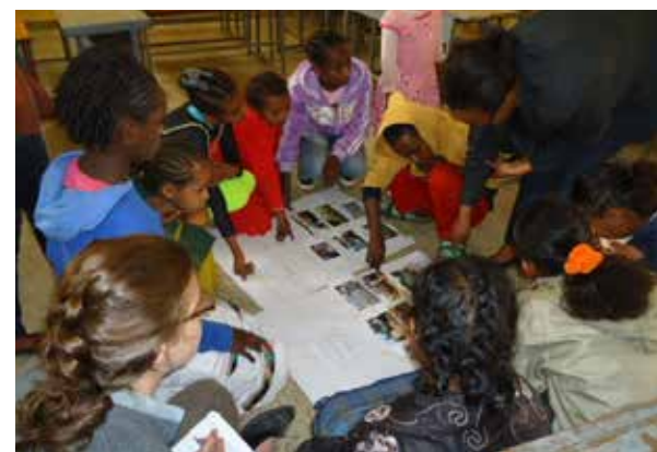
Girls with and without disabilities sort photographs from the Picture Library.