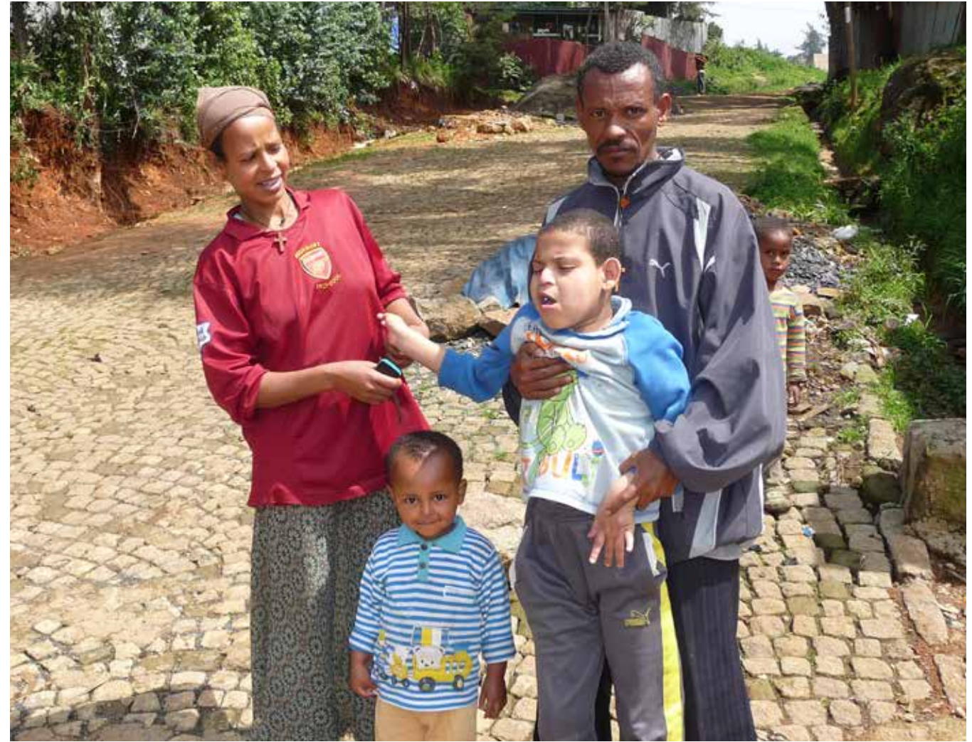
Visiting children with disabilities and their families at home.