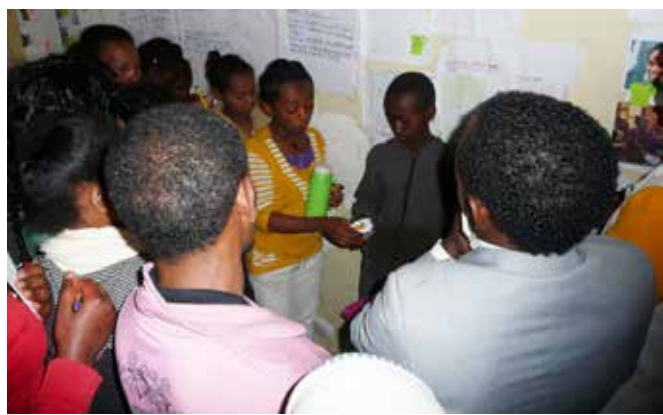
Using Story in a Bag to explain gender roles.

This can be a good activity to conduct in pairs — children with disabilities paired with a child without disabilities. Try to identify someone who is around the same age and with whom the child with disabilities feels comfortable. This may be a sister or a brother with whom they spend time. Explain that you would like them to tell us a story about what is important to them in terms of safety and inclusion in the community. Let them take the bag home with them to collect objects that will help them to tell the story when you meet on another day. Collecting objects and planning the story together can foster reflection of different types of communication and contributions to activities.