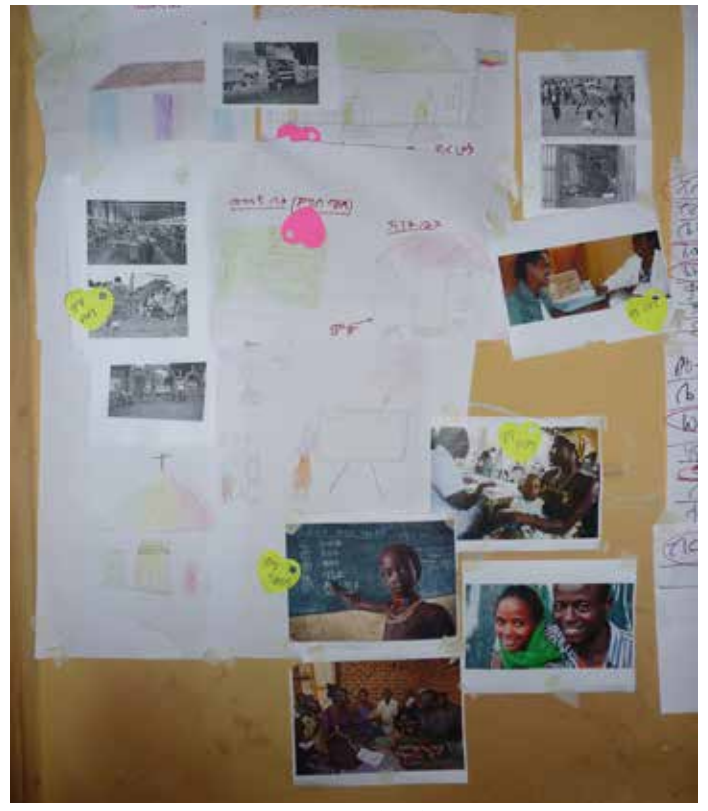
Artwork and picture library.

Flipchart paper, pencils and markers of different colors, and any other art materials that may be available.