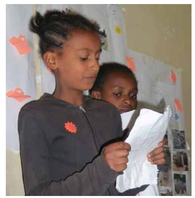
Adolescent girls with and without disabilities sharee poems about their experiences at a Community Workshop.