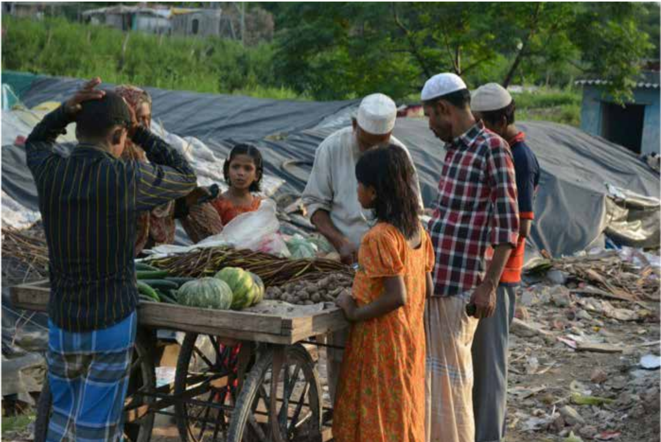
Rohingya refugees in Delhi.

UNHCR's local partners can be sites of intense discrimination for certain groups of urban refugees. Where local laws and social norms support discriminatory practices, UNHCR partners have a special responsibility to not only sensitize staff, but also provide training and operational guidance on engaging at-risk groups and on what meaningful feedback and accountability mechanisms can be put in place for their implementing partners.