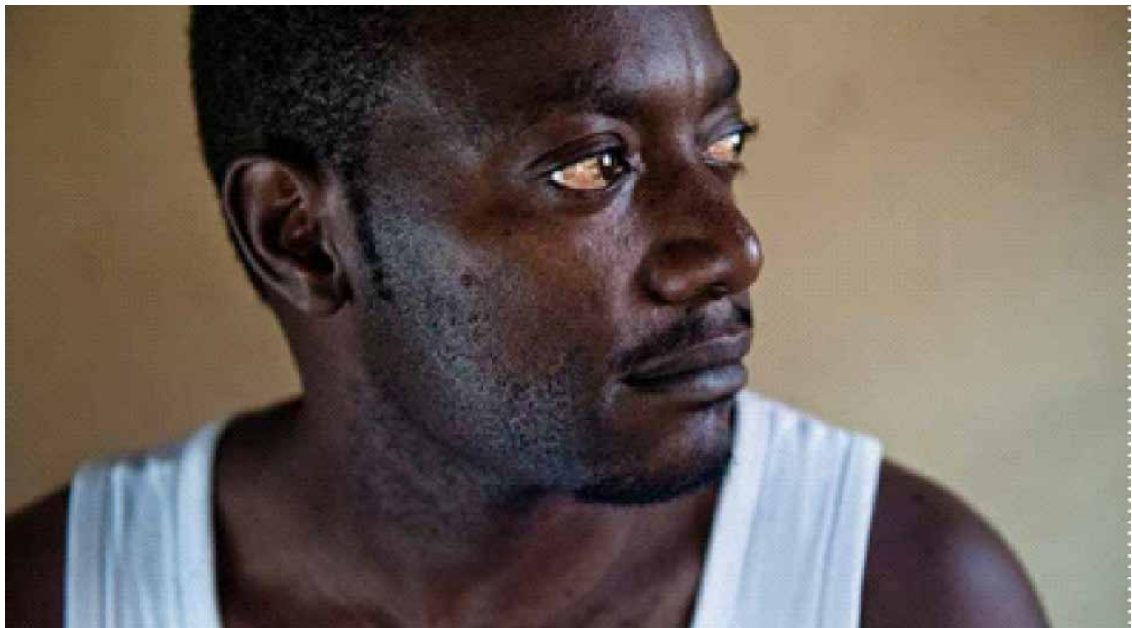
Male survivors of sexual and gender-based violence encounter significant barriers in accessing basic needs, from medical care, to safe shelters, to jobs.