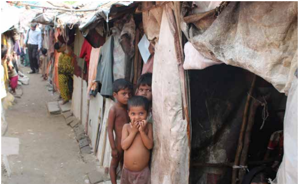
Refugees in cities often live in conditions that are not conducive to protection from GBV. Here, Rohingya refugees, Delhi.

This report highlights the need for protection strategies that are informed by, and responsive to, the unique contextual challenges and opportunities that exist in urban settings. It calls for more urban-specific funding and operational guidance, as well as capacity-building for field staff, bolstered by more formal opportunities to share good practices and information about what works, or is showing promise, in different cities worldwide.