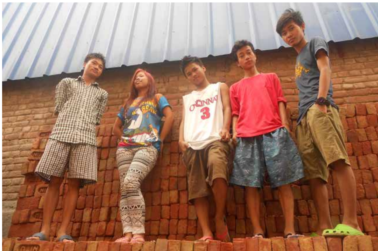
Burmese Chin refugee youth, Delhi.