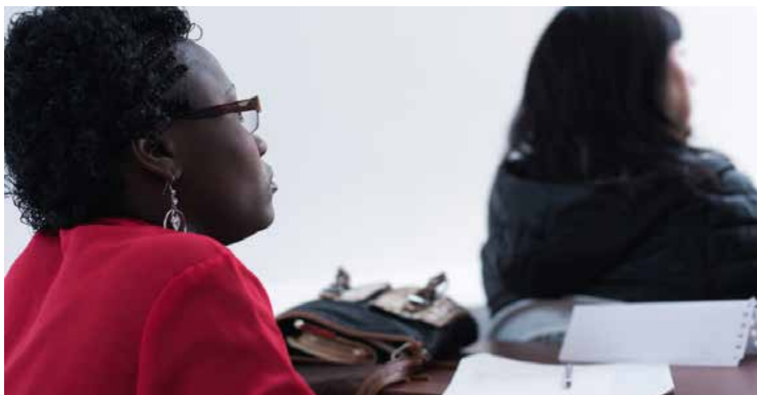
Colombian woman participating in a workshop in Quito.