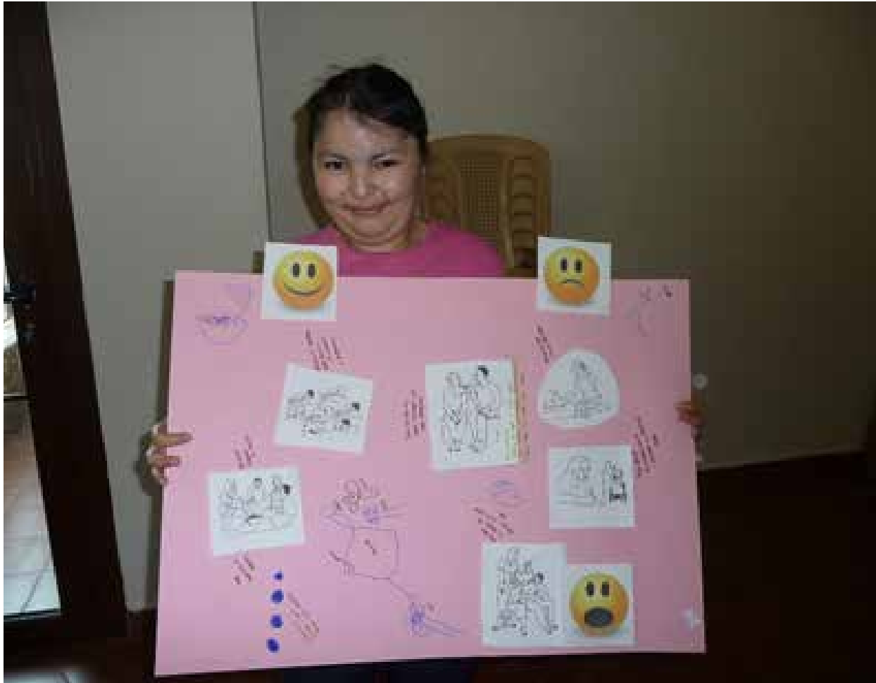
An adolescent girl with intellectual disabilities from Syria shares her concerns and ideas through pictures at a consultation in Beirut.

Similarly in Lebanon, rented accommodation is largely inaccessible to persons with physical disabilities, increasing their isolation and reducing their access to services and programs. Caregivers also reported that the lack of space and overcrowding of apartments present risks for the safety and dignity of individuals with disabilities, particularly women and girls with disabilities.