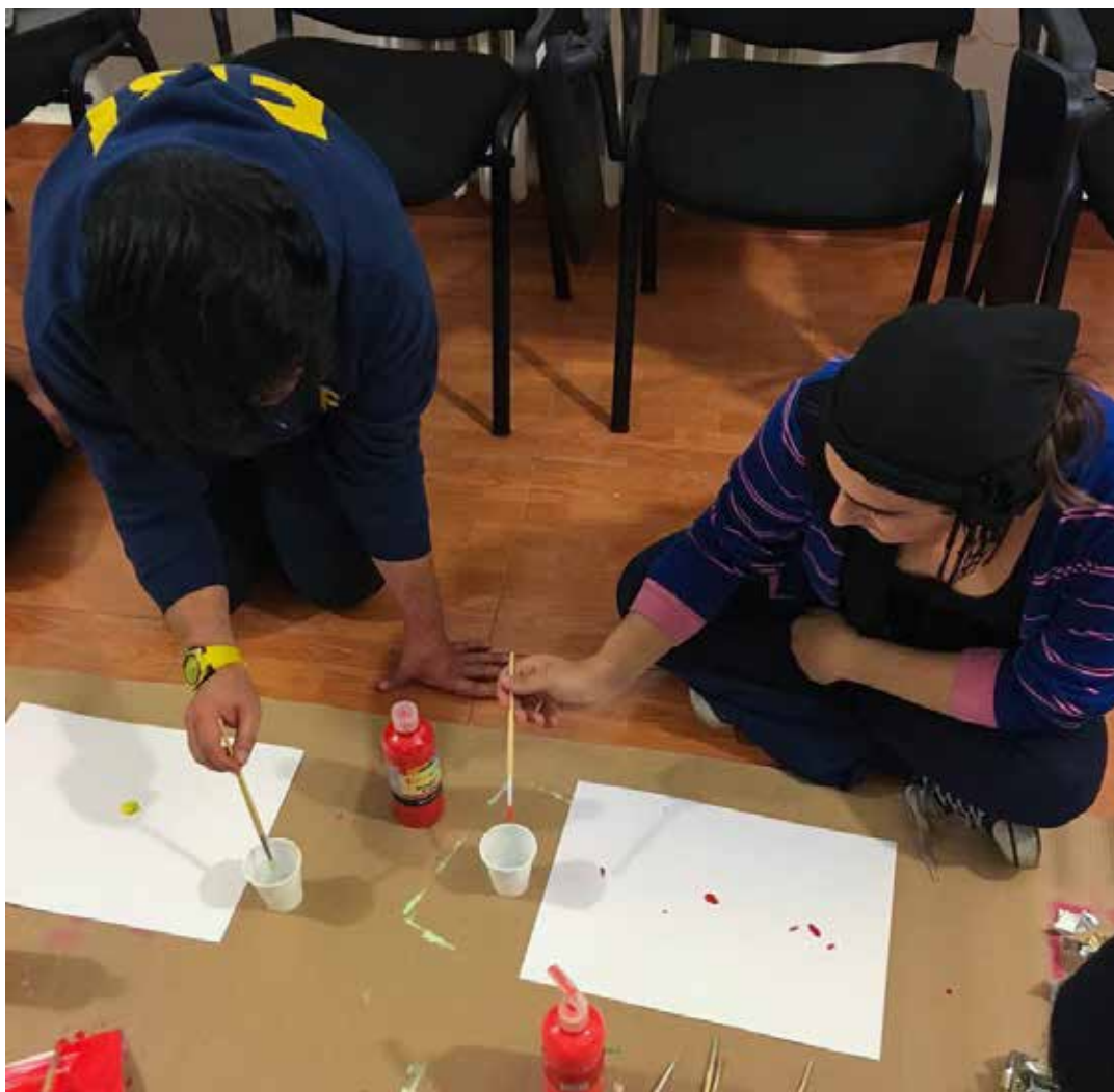
Syrian transwomen refugees in Beirut participate in an art therapy project.