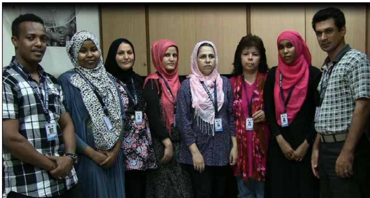
The RCDP Team in Delhi.