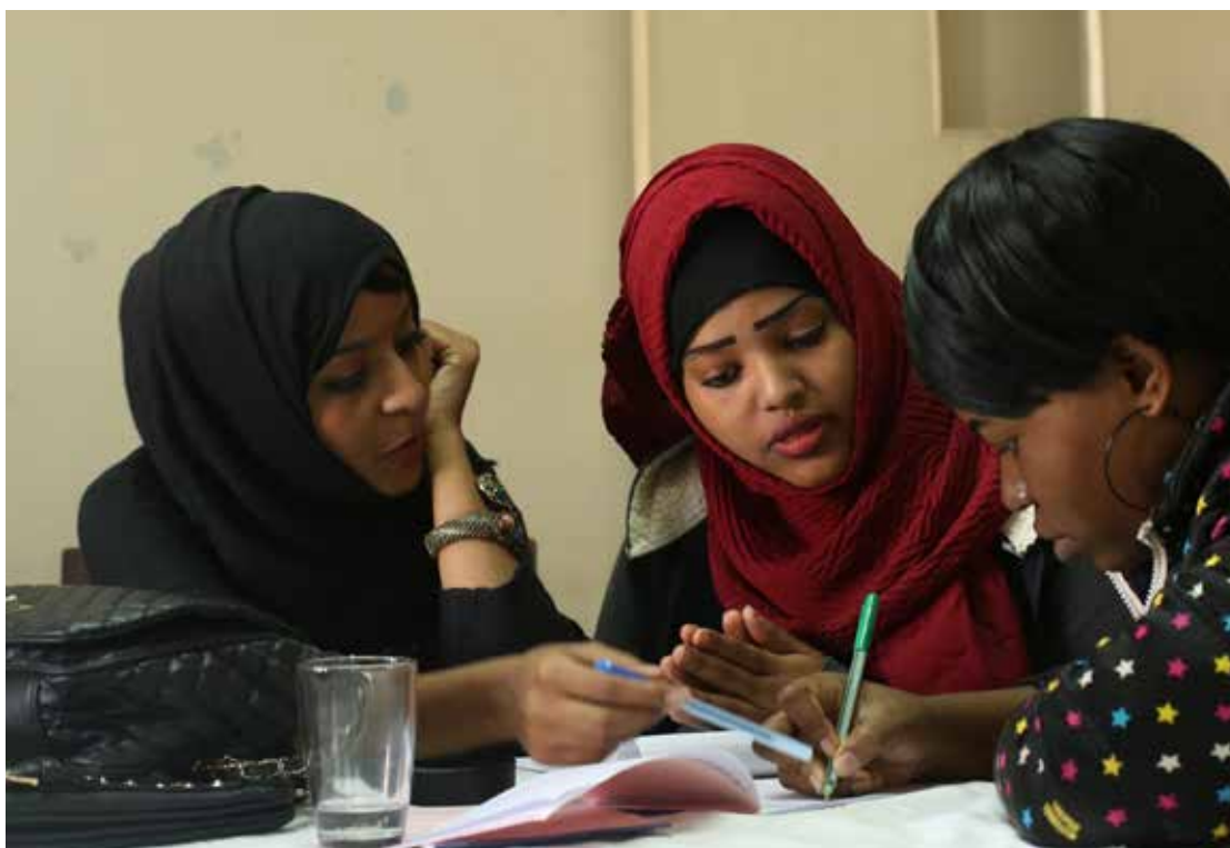
Somali women in Delhi participating in a Refugee Community Development Project workshop.

Women’s support groups. Refugee service providers are home to women’s support groups. For instance, there is a biweekly support group hosted by Asylum Access Ecuador in Quito. It is a safe space for women survivors of violence to interact, hear talks on different topics, share experiences and information with one another, and participate in wellness activities. Participants shared that it is one of few places they feel safe in the entire city, and their only outlet for accessing peer support.