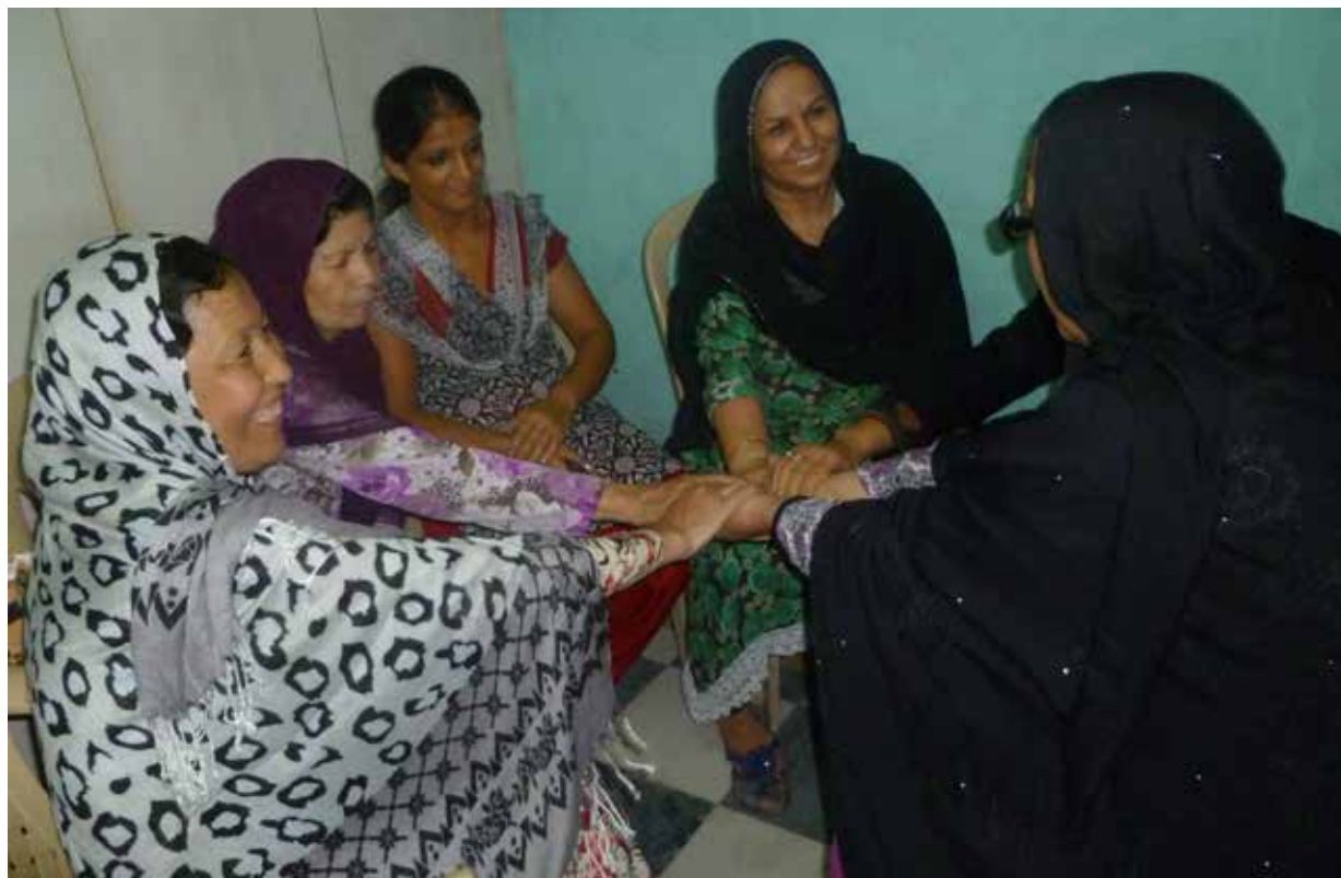
Afghan women in Delhi participating in a group activity run by the Refugee Community Development Project.

From the onset of urban response, UNHCR must consider which potential local partners currently have the skills, capacities, sensitivities, and personnel to serve all refugees and/or particular subpopulations; what additional training and recruitment is needed to bring local partners' service provision and GBV case management up to humanitarian standards, including the survivor-centered approach called for in the IASC Guidelines; 10 and what meaningful feedback and accountability mechanisms can be put in place for their implementing partners, mindful that certain groups of refugees may have greater or less access to any one mechanism.