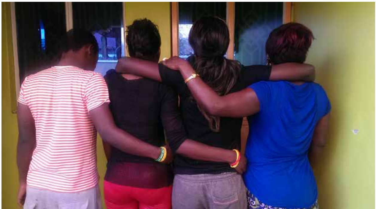
Refugee sex workers in Kampala.

Yet refugee sex workers feel strongly that they experience more frequent and more severe risks of violence than host community sex workers. As refugees, they experience additional layers of discrimination, stigmatization, isolation, and risk because of where they are from, the language they speak, and the color of their skin. Many refugees also fear that if anyone – from police officers, to refugee service providers, to neighbors – finds out they are selling sex it could compromise their asylum claim