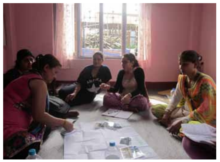
Data collectors debriefing after an activity and recreating the safety mapping exercise.

Upon completion of data collection, the WRC analyzed the transcribed data on NVivo 10, a qualitative data analysis software, and Excel. Photographs of the violence and treatment sorting activities were included to support the verbal transcripts. Findings were analyzed within and between activities, with comparisons made across sex, age and impairment group of participants, where feasible.