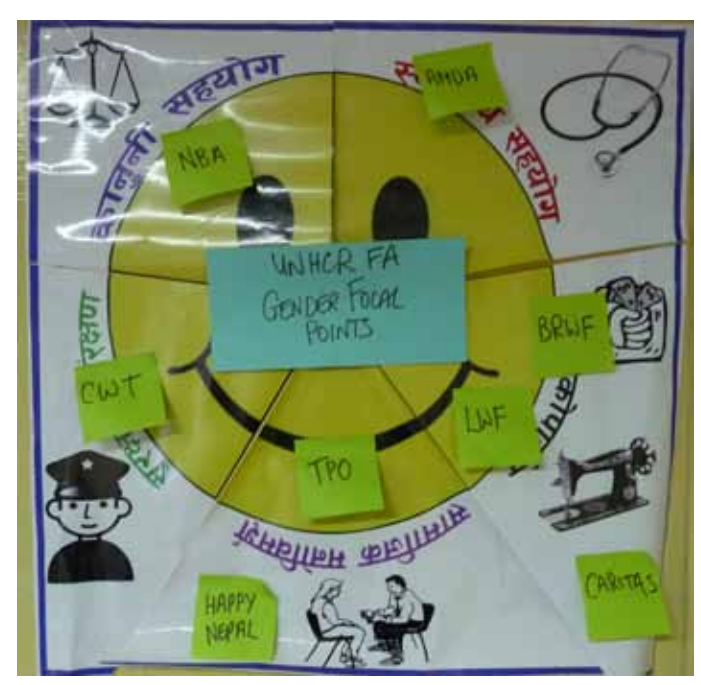
Some of the organizations that work with refugee populations in Nepal.

study further found health care and facilities provided by the Government to often be inadequate, particularly for persons with intellectual and developmental impairments. As a result, the SRH needs of women with disabilities are frequently neglected.<sup>25</sup>