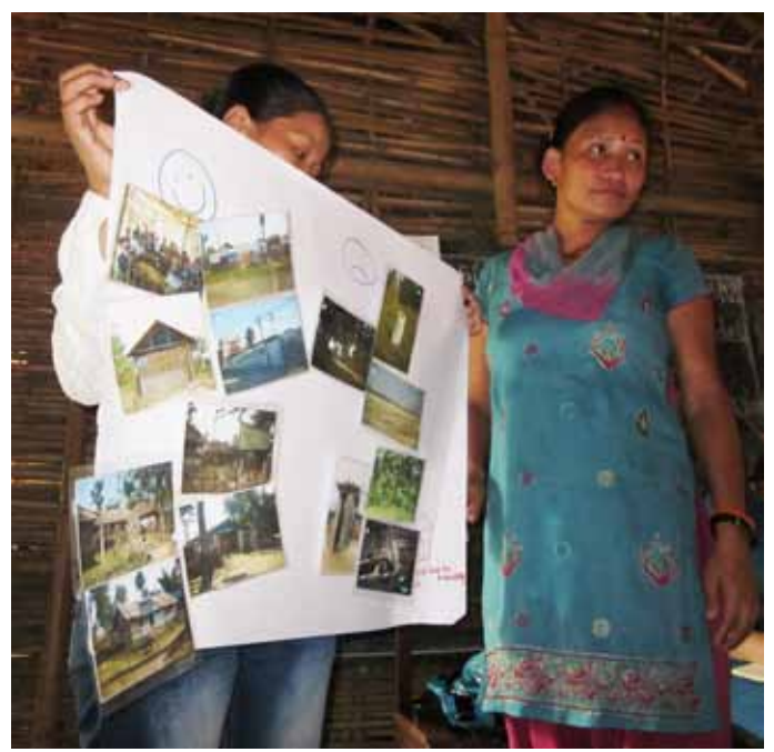
Participants show which locations they consider safe and those that they believe are unsafe during the WRC's consultative visit that preceded that study, in August 2012.

Safety concerns: Participants unanimously identified the disability center, Lutheran World Federation (LWF), the UNHCR office and the vocational training center as "safe" locations. Predominantly "unsafe" locations included the forest/jungle, followed by the market and the communal kitchen. Caregivers shared protection concerns regarding their family members with disabilities who could be at risk of sexual violence, particularly those with intellectual impairments. Despite protection risks, no participant could identify health problems or consequences that could be prevented if they sought medical care in a timely manner after experiencing sexual assault. Participants who were home based reported feeling safe with family members and caregivers; however, the home itself was seen as unsafe by some group participants where family members guarreled or became violent under the influence of alcohol. On the whole, men especially felt the camp was safer due to resettlement.