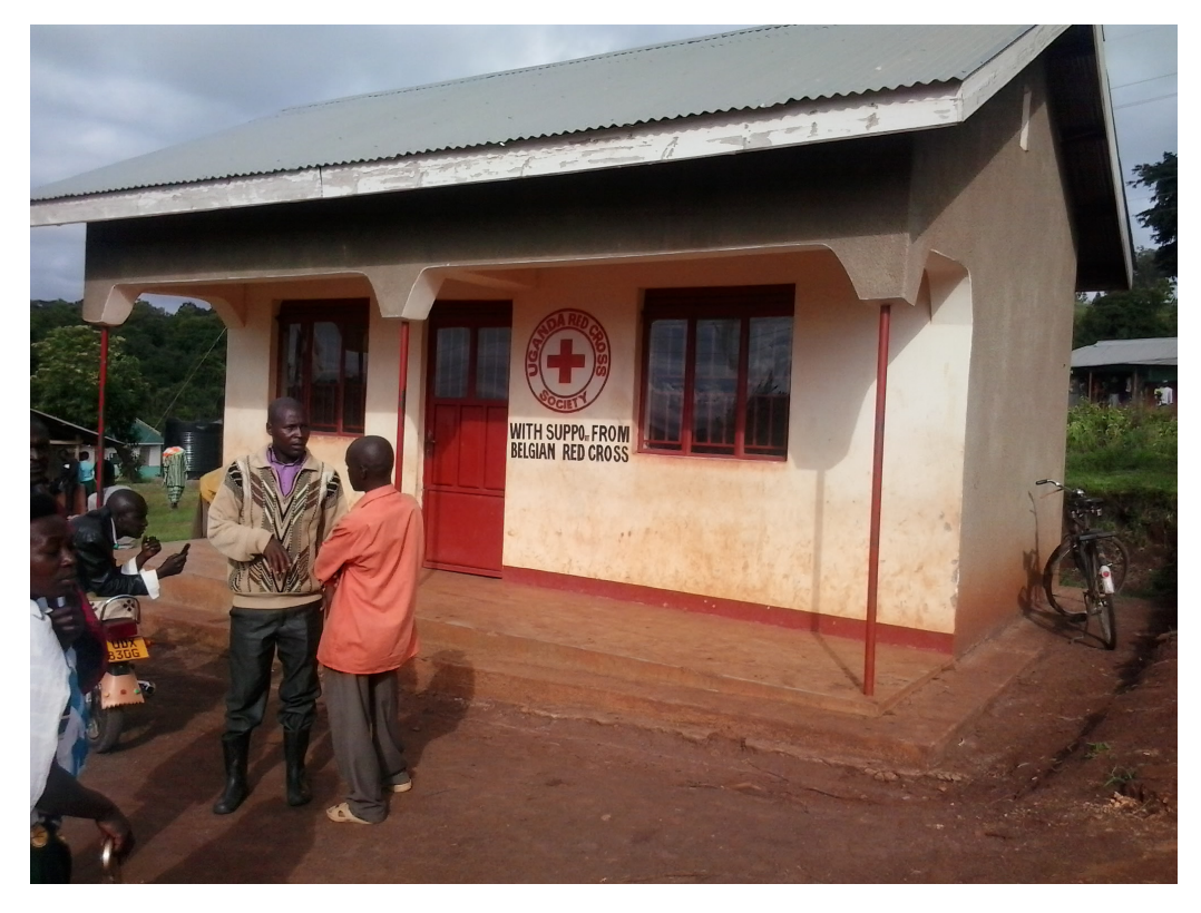
Red Cross office