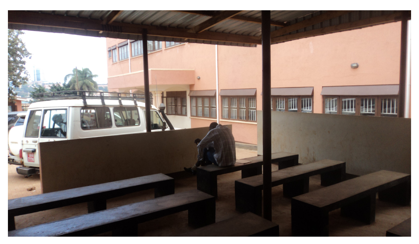
Waiting area at OPM (Office of the Prime Minister)