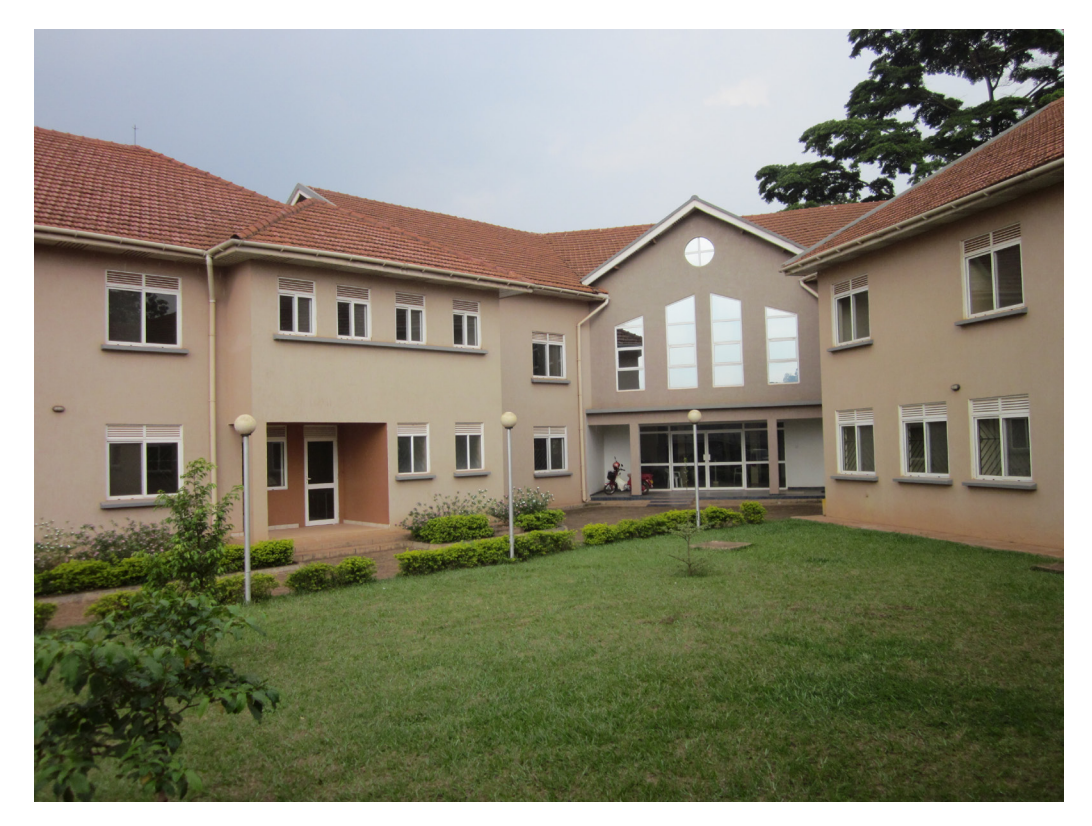
New maternity wing at Kisenyi Heath Center IV