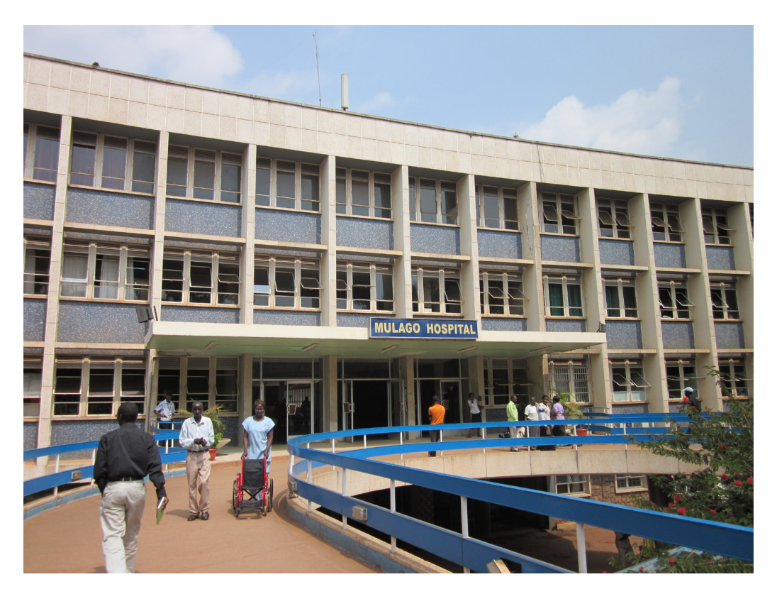
Mulago Referral Hospital