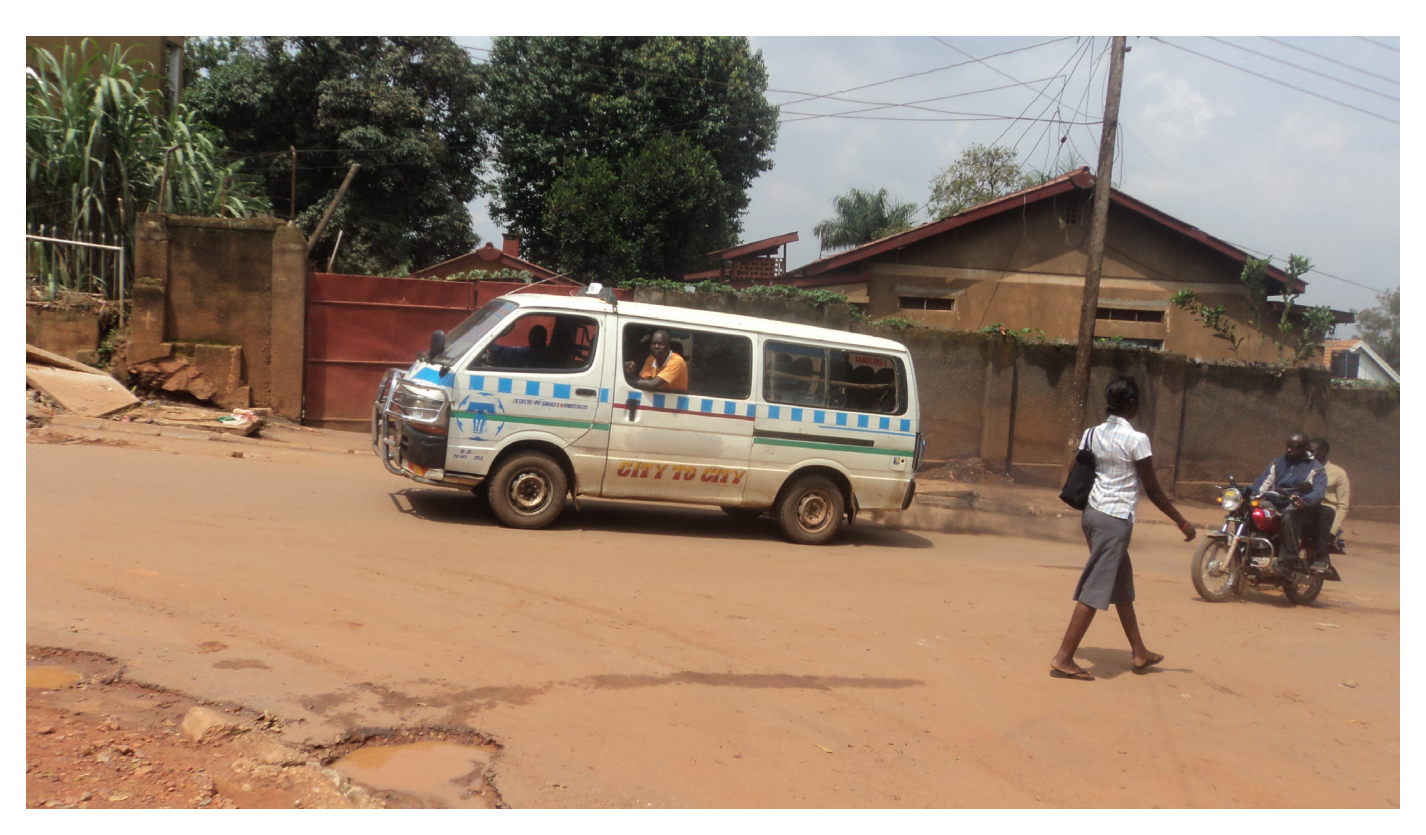
Public taxi and boda boda