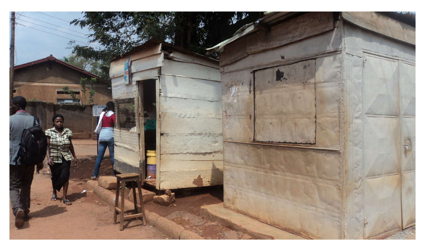
Shops and workplace