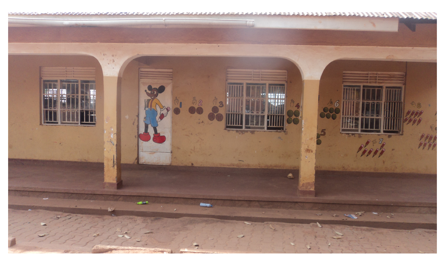
School for the blind