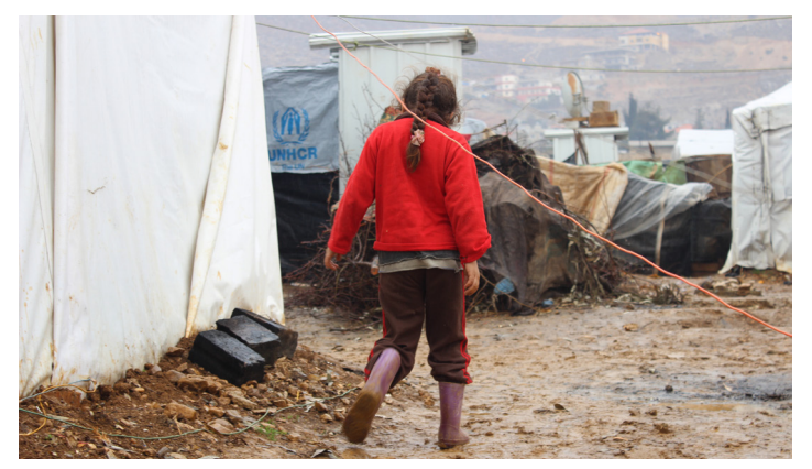
Photographs, such as this one of a girl walking, were used to elicit discussion.

The third phase was only implemented in Ethiopia and Thailand, because Lebanon was facing an acute emergency from the daily influx of refugees fleeing the conflict in Syria.