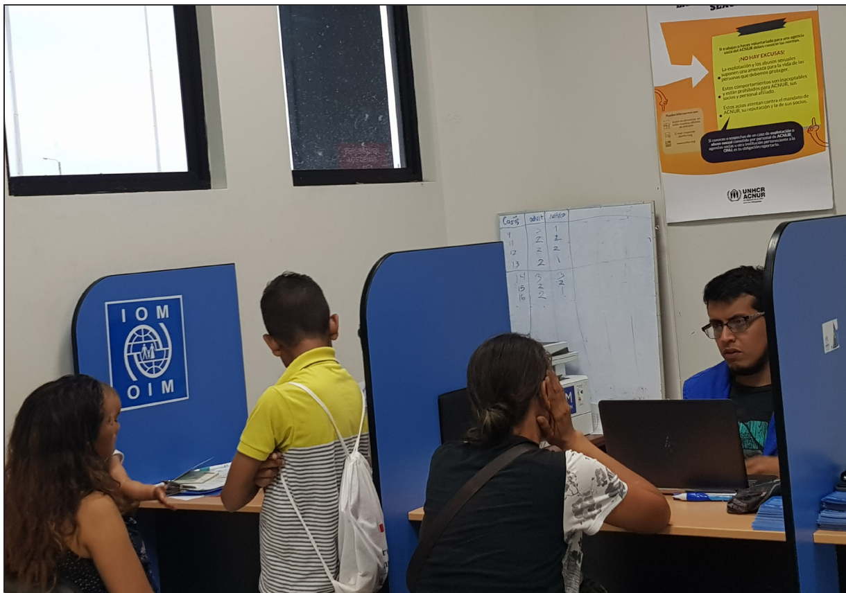
Venezuelans seeking advice and orientation on arrival in Peru, Tumbes, Peru.