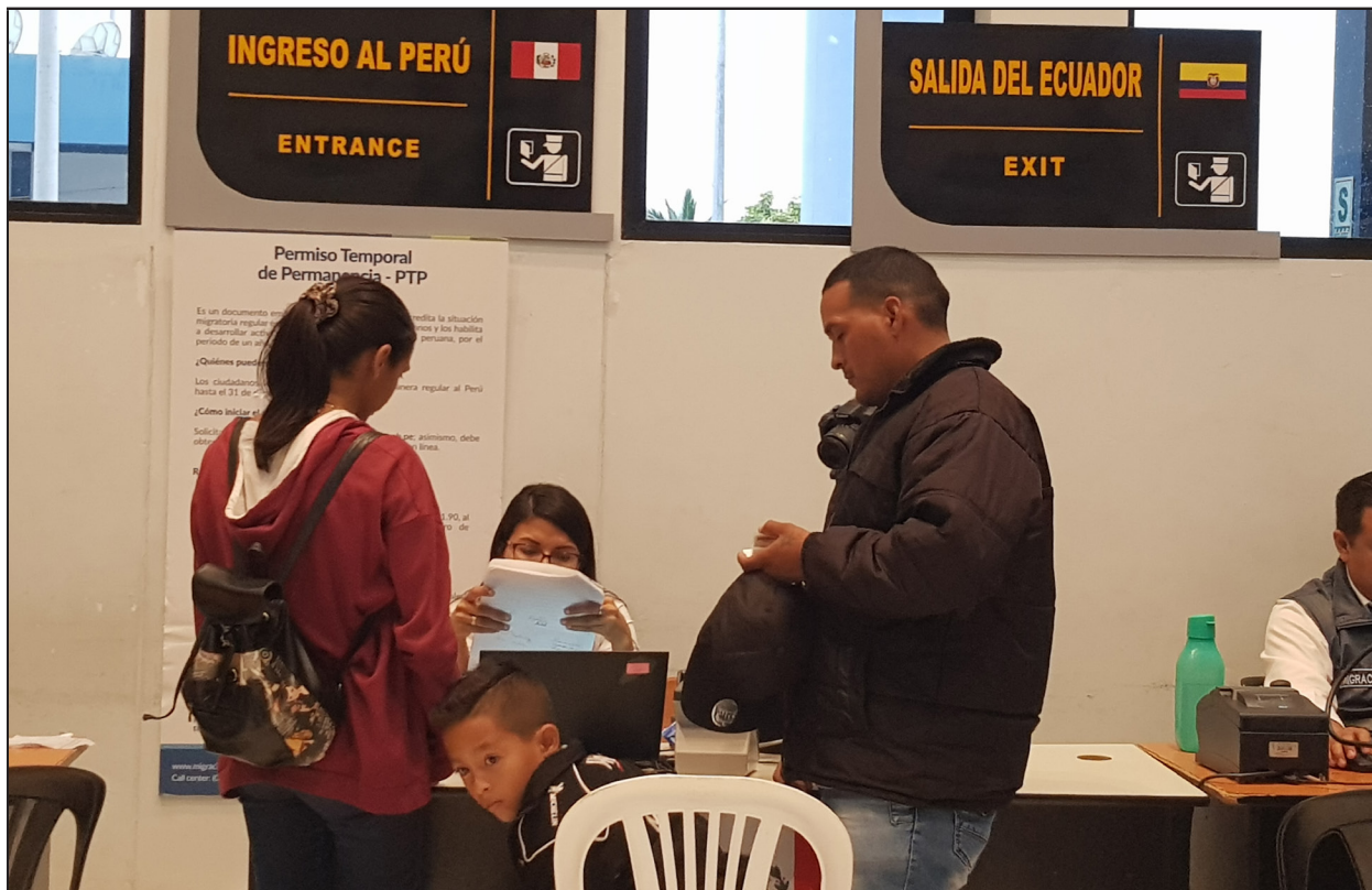
A Venezuelan family at the Peru-Ecuador border.

The volatile situation in Venezuela could result in an ever-bigger mass outflow of people. It could also potentially lead to some people deciding to return home, although many Venezuelans who have left the country express the intention not to return until they see a consolidation of change and the rebuilding of failed institutions. These preconditions could take years to meet. Other dynamics could affect the displacement flows. The increasing saturation of the job market in Peru, for example, could lead Venezuelans to aim for other host countries, such as Chile. The potential for increasing hostility and xenophobia in host countries toward Venezuelans could also influence migration within and across countries.