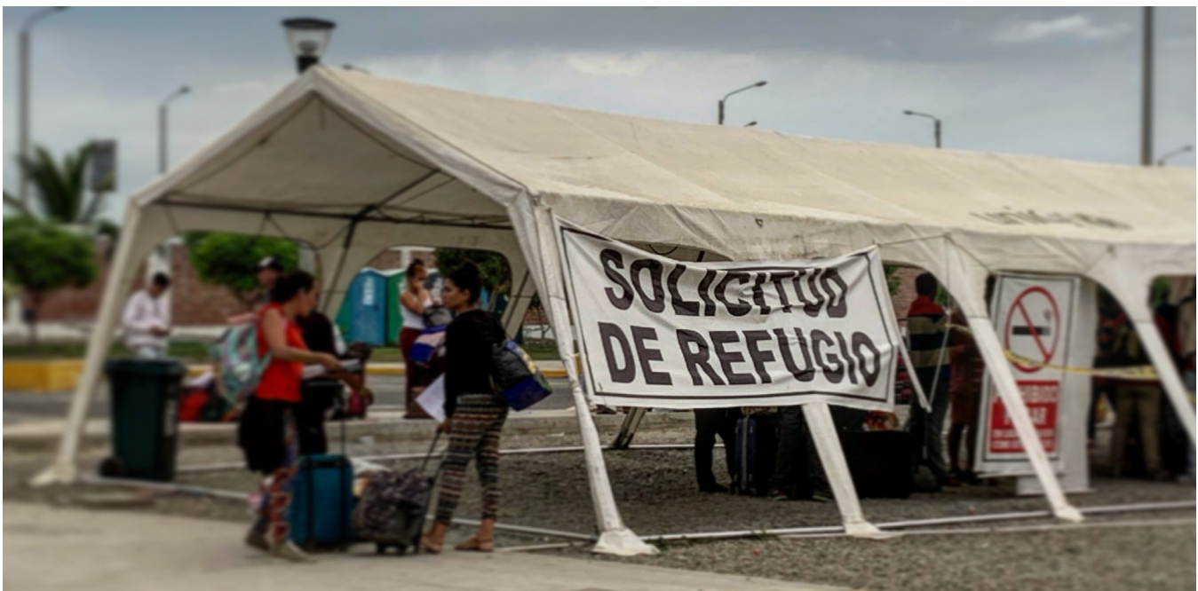
Tent where new arrivals in Peru can apply for asylum, Tumbes, Peru.

The United Nations (UN) has established a Regional Inter-Agency Coordination Platform for Refugees and Migrants from Venezuela—under the leadership of UNHCR and IOM, and including many non-UN actors, to complement government-led responses and initiatives. National Platforms have been set up in Ecuador and Peru. The Regional Platform has developed a Regional Refugee and Migrant Response Plan (RMRP) to support host governments receiving Venezuelan refugees and migrants, and has put out an appeal for US$738 million. 3 As at February 6, 2019 only $12.5 million of this appeal had been funded according to UN figures. 4 It is essential to the response to Venezuelan refugees and migrants in Ecuador and Peru that this appeal be funded. It will be important to ensure that the funding is inclusive of national and local civil society organizations and that it is used to strengthen existing mechanisms that will benefit Venezuelan refugees and migrants, as well as host communities. In this region, national and local civil society organizations are central to humanitarian and development responses. Key agencies have come together at the regional level to develop a "civil society action plan on persons leaving Venezuela who require national and international protection." 5