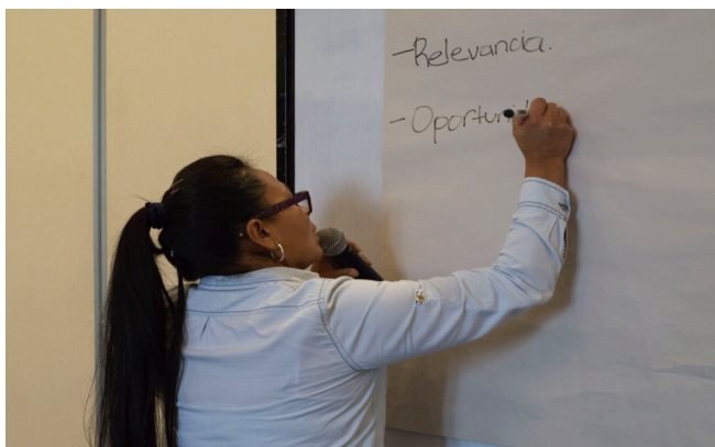
Quito workshop facilitator taking notes

Participants appreciated the opportunity to meet new potential partners. “This workshop was the first time we were able to interact with different actors,” said one Delhi workshop participant. One of the highlights of the Beirut workshop was the “diverse participation of refugees and local organizations,” stated another participant.