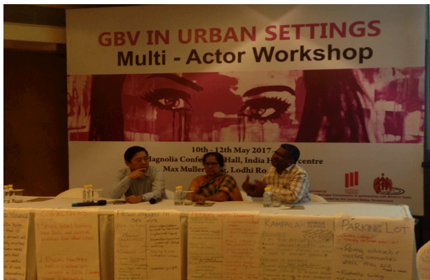
Representative from the Delhi Police Commissioner's Office, the Child Welfare Committee, and NAZ Foundation

Additionally, participants discussed urban-specific outreach strategies, exploring how to reach refugees who are dispersed and hidden in urban settings, particularly those who are marginalized and at high risks of GBV. The case studies provided ideas for reaching hidden populations, and participants shared some of their own creative strategies, including population-specific approaches.