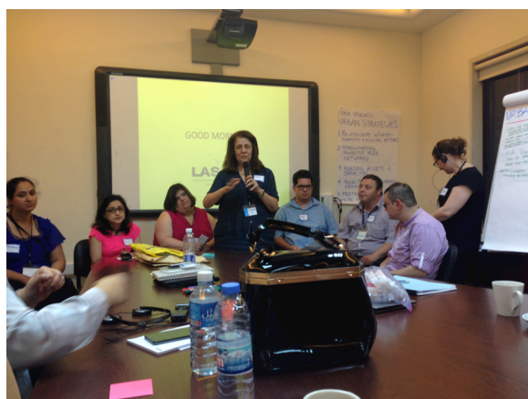
LASA self-advocates presenting on their work with refugees with disabilities in Beirut

Participants across the four workshops came in with different areas and levels of expertise. In follow up surveys, nearly 90% of all participants agreed or strongly agreed that the workshop had “improved [their] understanding of urban humanitarian response, especially challenges and strategies for improving GBV prevention and response for urban refugees.”