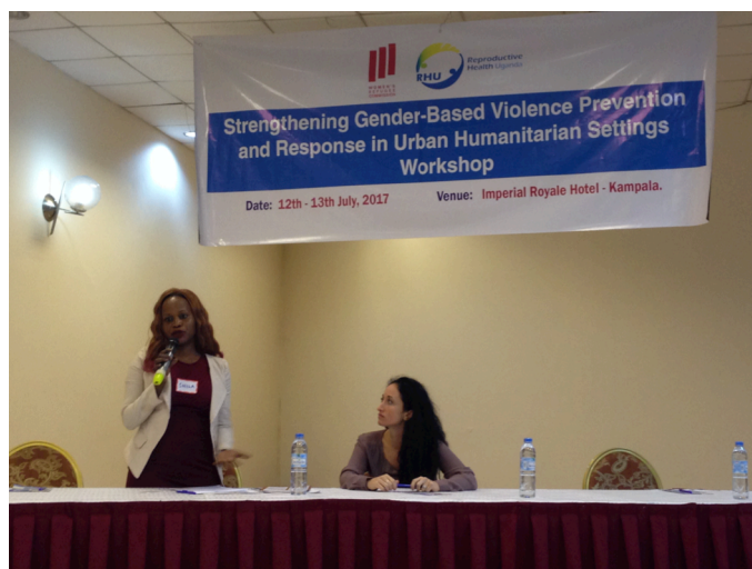
A presentation from the Organization for Gender Empowerment and Rights Advocacy (OGERA), a refugee sex worker-led organization in Kampala

As reported in Mean Streets , refugees are extremely active in their communities; they build their own communities and have safety mechanisms in place that work for them that humanitarian actors can support. 10 Sometimes these communities consist of other refugees; other times, the ‘communities’ most relevant for certain refugees are primarily members of the host-community. 11 Efforts to promote or strengthen community-based protection should account for such diversity by ensuring that refugees’ input and perspective drive programming priorities.