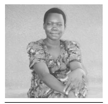
AFGHAN REFUGEE YOUTH