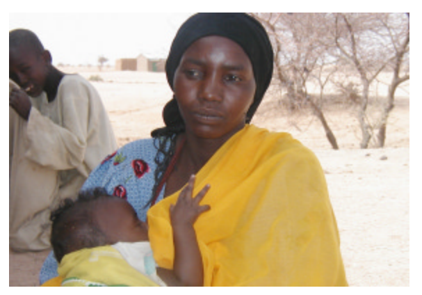
Mother and child in Amnabak.

The first prong was completed in 2003 and a report completed. The current report addresses the second element of the evaluation for Component 4.