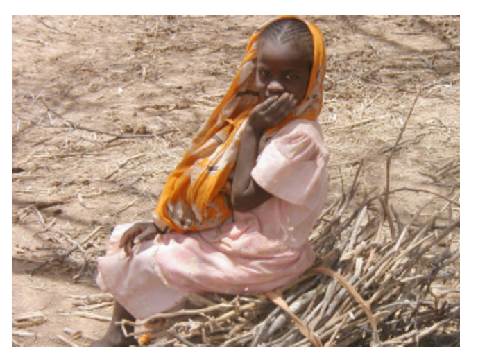
Girl collecting wood in Touloum.

UNFPA submitted a proposal to the United Nations Consolidated Appeals Process (CAP) with a planned launch on April 10. The proposal included funding for a full-time RH coordinator, training and planning for the future. However, the CAP has not been well funded so far and in addition, there must be another mechanism to ensure funds are available at the start of the emergency. One international NGO submitted four proposals integrating the MISP with primary health care to different donors and all were pending a response during the assessment team's visit. This situation highlights the obstacle of funding to implementing MISP activities; agencies must react swiftly in emergencies and need to have readily available funds to do so.