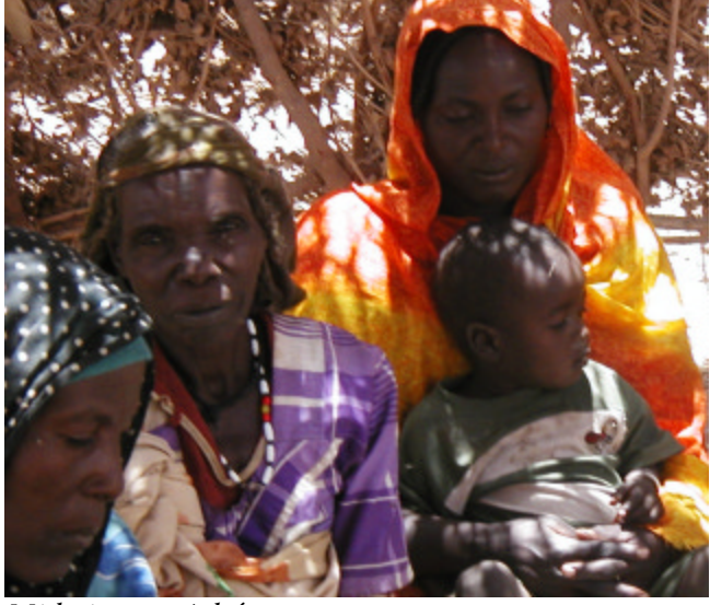
Midwives at Adré.