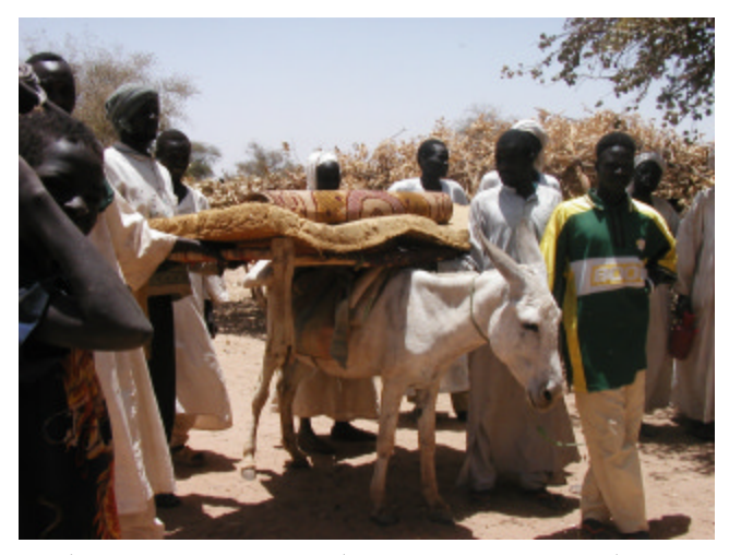
Donkeys are sometimes used to transport women who are experiencing problems in childbirth.