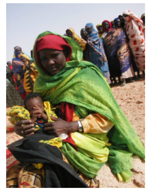
Women gave birth on the roadside, such as this woman near Tine.