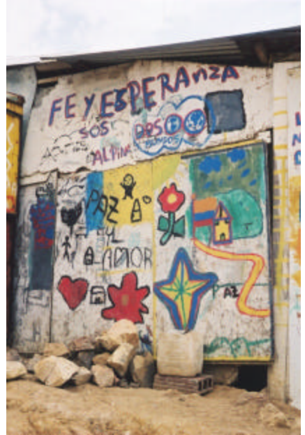
Escuela Fe y Esperanza (School "Faith and Hope").

In Bogotá there are schools where a majority of the children are displaced, especially in Ciudad Bolívar, Kennedy and Bosa. 149 Officials from the Ministry of Education recognize that IDP children need special attention. They reported openly that education is treated as a lower priority in IDP programming because it is less visible than the need for food and housing. They described cuts in funding and an absence of financial support at the national level. The Ministry presented a $13 million proposal to the Departamento Nacional de Planeación (DNP – National Department of Planning) as part of "Plan Colombia" USAID funding. But the DNP gave priority to other programs and did not include the education proposal. 150