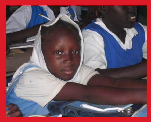
Women and children are the most at-risk population in Darfur; gender-based violence is widespread.

The marked increase in violence and insecurity has significantly limited access to the displaced populations by humani-