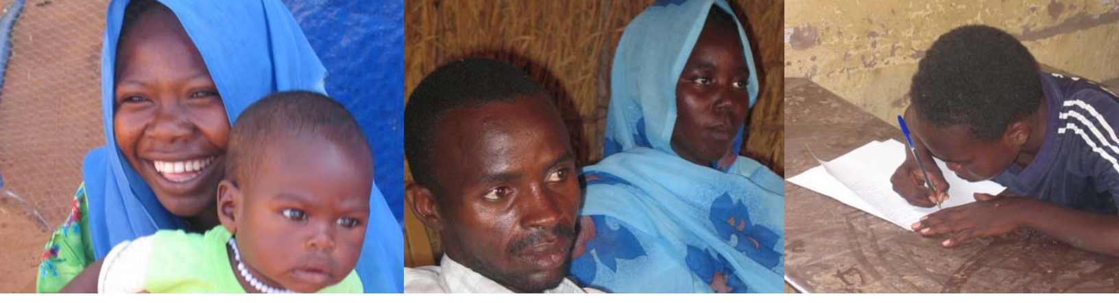
Adult literacy classes are very popular in the IDP camps in which they are offered and are often the first chance women have had to learn. These classes not only help women learn to read and write, but also convince them of the importance of education for their daughters.