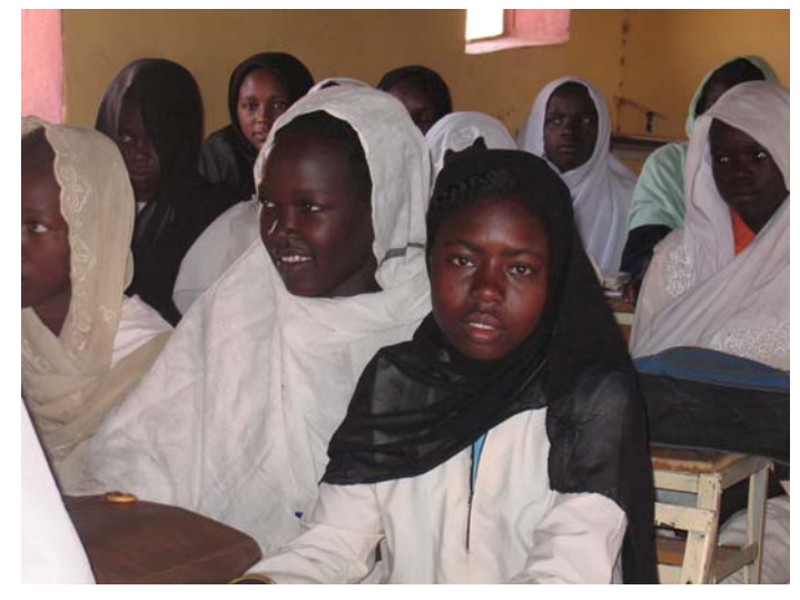
Many girls are in school for the first time in the IDP camps. A teacher in a camp said, "If a girl is not educated, she will have no future."

Children in Darfur face many challenges in receiving an education: too few teachers, overcrowded classrooms and limited or no supplies, among others. Youth face even more difficult barriers: secondary schools do not exist in the internally displaced persons (IDP) camps, leaving young people in the camps with nothing to do and little hope for the future. The ever-worsening security situation in Darfur only makes matters worse. In addition, the crisis, which is nearly four years old, is still