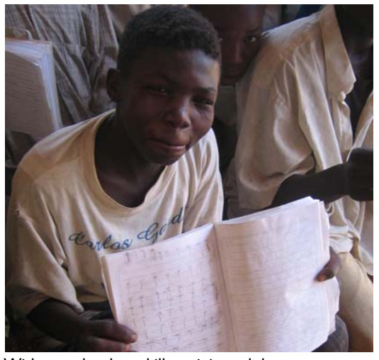
Without school or skills training, adolescents in the IDP camps have nothing to do and are becoming increasingly frustrated and hopeless for the future.