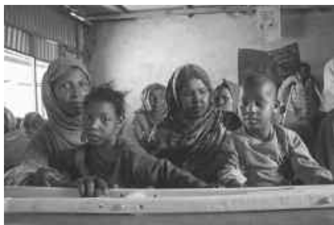
Local NGO CCBRS, Comprehensive Community Based Rehabilitation Somaliland, in partnership with UNHCR, provides physical therapy to the disabled as well as sexual and gender-based violence counseling in Hargeisa IDP settlement, Somalia.

The IASC Guidelines on Mental Health and Psychosocial Support in Emergency Settings provide a framework for understanding mental health and psychosocial problems in emergencies that is also useful when applied to persons with disabilities. 65 The guidelines state that mental health and psychosocial problems may be predominantly social or psychological in nature. Social problems may have existed before the emergency (e.g., poverty; preexisting discrimination and social exclusion). They may be emergency induced (e.g., family separation; disruption of social networks and community structures; gender-based violence) or humanitarian aid induced (e.g., undermining of community structures or traditional support mechanisms). Problems that are predominantly psychological follow the same model. They may be preexisting (e.g., severe mental disorder), emergency induced (e.g., depression and anxiety disorders, including post-traumatic stress disorder and grief) or humanitarian aid induced (e.g., anxiety due to lack of information about food distribution). The IASC Guidelines on Mental Health and Psychosocial Support identify people in the community with preexisting severe physical, neurological or mental disabilities or disorders as a subgroup that could be at increased risk of developing mental health problems in an emergency. Other at-risk groups include elderly people, especially those who have lost caregivers; people in