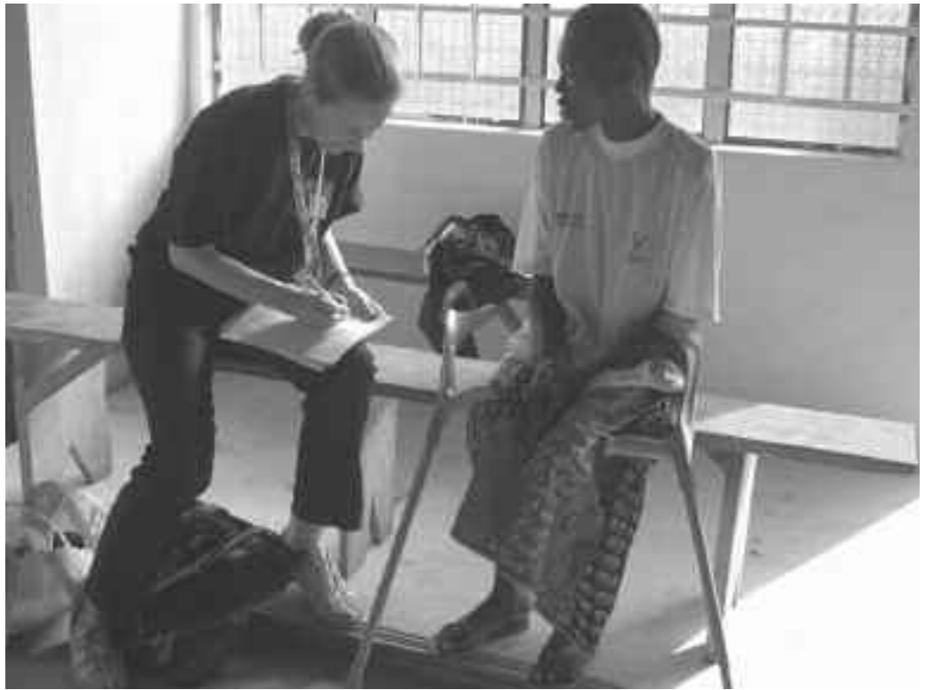
A girl who was disabled by the war in Sierra Leone meets with the Women's Commission.

community affairs and activities. Often mothers abandoned by their husbands and families and left alone with children with mental disabilities felt that they had no choice but to tie up their children if they wanted to leave their house for any reason. Although children with mental disabilities were able to attend school, they were much more likely to be ignored and neglected and not receive the support and assistance they needed. The priority, according to UNHCR, was to address negative attitudes toward people with mental disabilities through community awareness raising and public information programs. 40