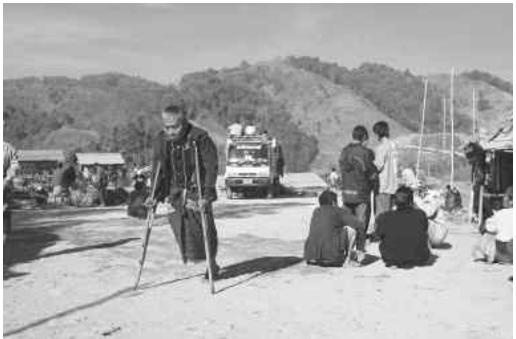
Refugees from Myanmar (Burma) at Umpien Refugee Camp, Thailand.

Almost all the refugee situations surveyed identified problems with the physical layout and infrastructure of the refugee camps or settlements, and lack of physical access for persons with disabilities. In refugee camps, refugees with disabilities noted the physical inaccessibility of shelters, food distribution points, water points, latrines and bathing areas, schools, health centers, camp offices and