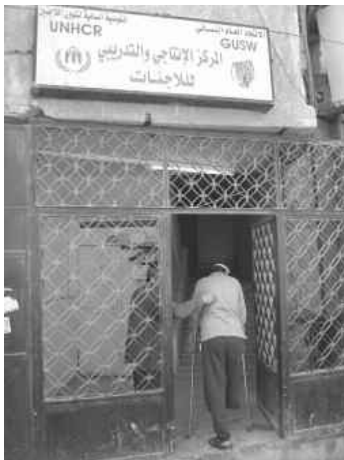
A disabled Iraqi man entering a vocational training center funded by UNHCR in Damascus, Syria.

In some countries, UNHCR, the government and partner organizations have coordinated effectively to gather data on the number and profile of refugees with disabilities in the camps. A comprehensive data collection exercise was carried out in the Dadaab refugee camps in September 2007, for example, providing very detailed information on the numbers and types of disabilities in the camps and on the immediate needs of people living with disabilities. 44