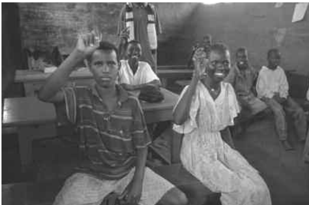
Sudanese refugees in Kakuma Camp, Kenya, attend a class for deaf children using sign language.

opportunities to find employment or set up their own small businesses.