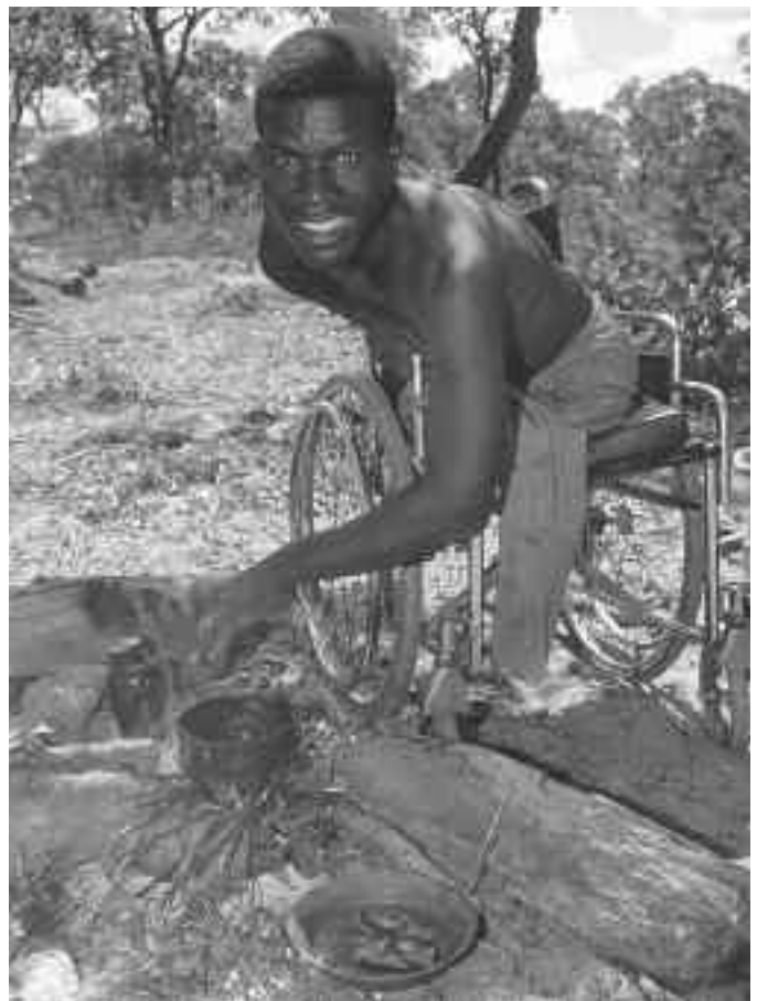
Disabled Angolan refugee in Nangweshi Camp, Zambia.

A positive example of taking the needs of persons with disabilities into account in food and nonfood distribution systems can be found in Dadaab, Kenya, where UNHCR reached an agreement with WFP that