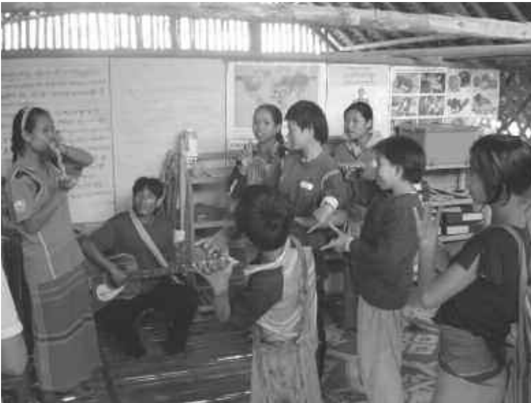
Deaf refugee children from Burma learn to sign in Thailand.

goal of integrating students into mainstream schools at the secondary level. A significant development in the refugee camps has been the documentation of Karen sign language and the dissemination of Karen Braille, which had already been created in Myanmar (formerly, Burma).