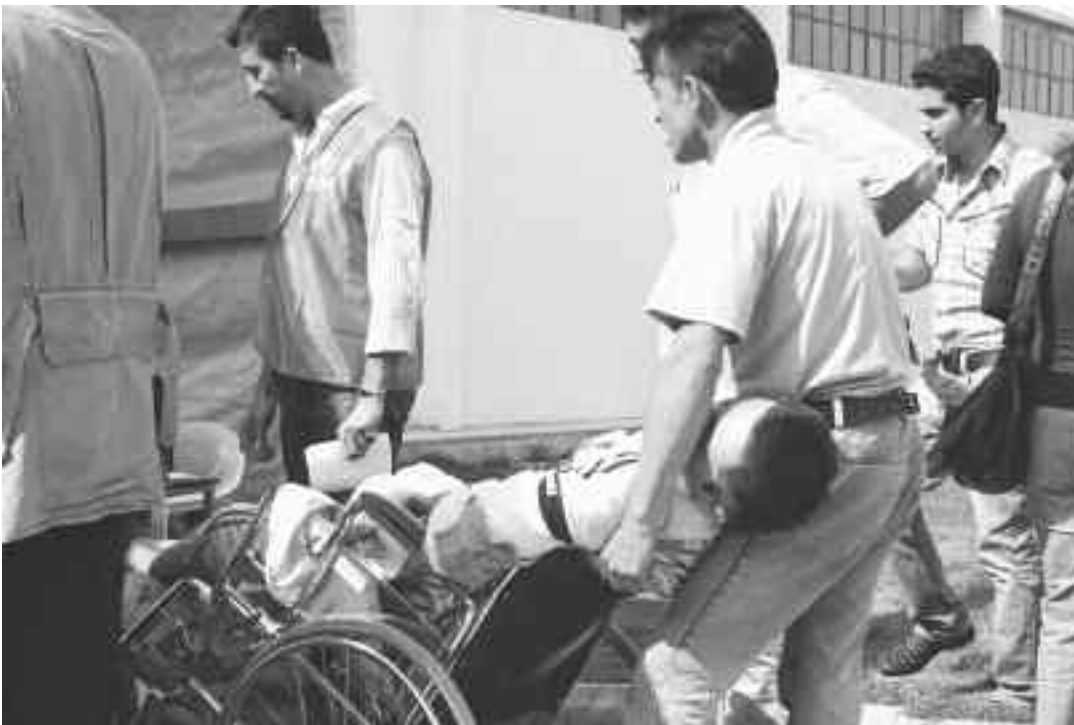
UNHCR has a dedicated registration center for Iraqi refugees located in Douma, 25 km from Damascus, Syria. A refugee injured in the war waiting at the registration center in order to receive an interview appointment.