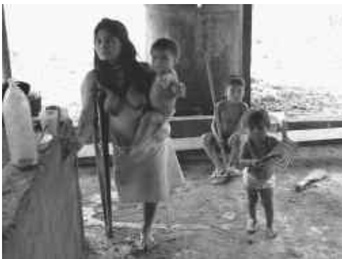
Many indigenous people in Colombia fall victims to land mines while trying to flee their homes in search of safety.

In general, it is harder for humanitarian agencies to implement refugee assistance programs in urban areas not only due to the dispersed and hidden nature of the community, but also because of government restrictions. With urgent needs in the community at large, restricted access and limited resources, the needs of refugees with disabilities are often neglected by humanitarian organizations in urban refugee programs, and there are few targeted programs for urban refugees with disabilities.