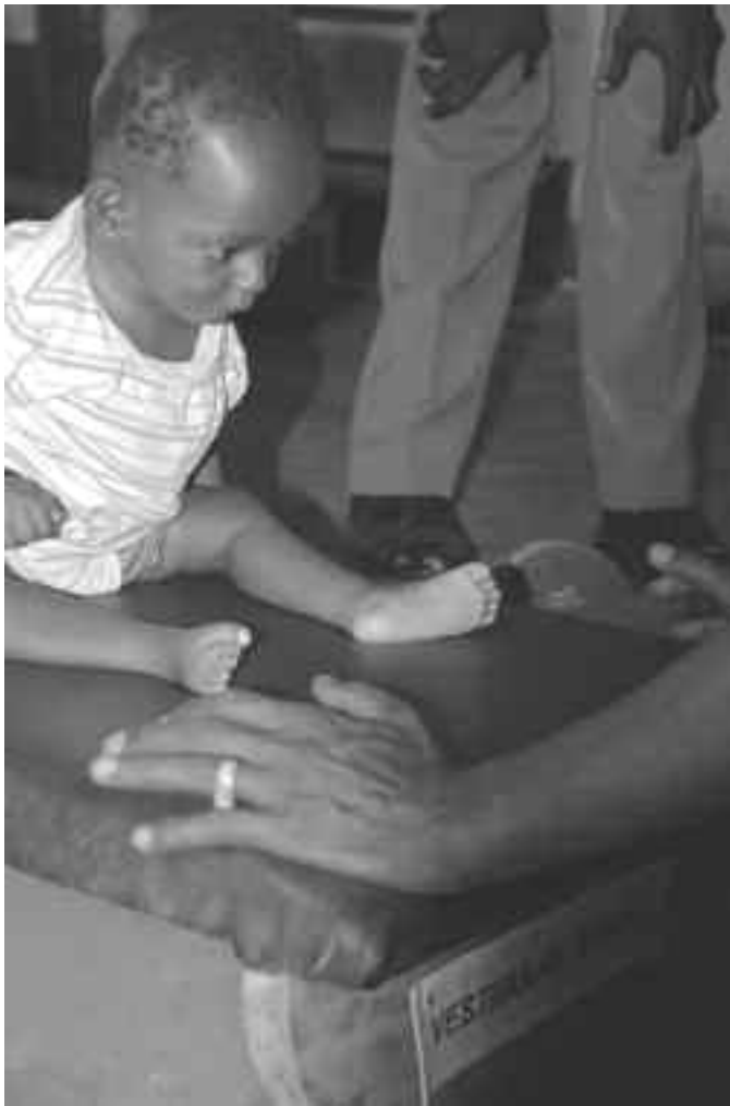
Child being treated at International Rescue Committee Physical Therapy Unit, Kakuma Camp, Kenya.

to be involved in camp management structures, even in those places where there were high levels of disability awareness.