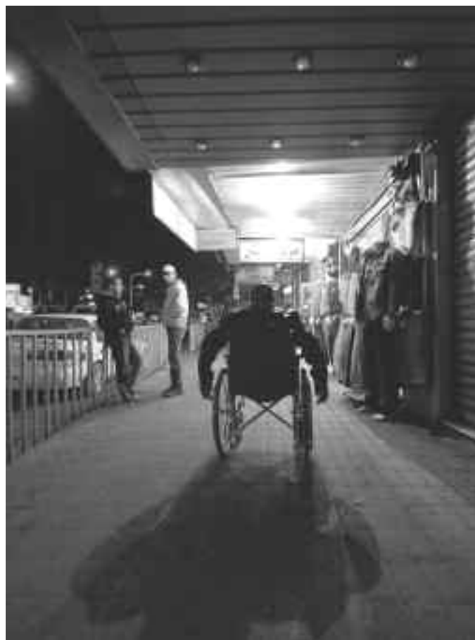
Disabled Iraqi veteran of the Iran/Iraq war in Amman, Jordan.

According to information from UNHCR, Dadaab is located in a river delta with very sandy ground. This makes it especially difficult for refugees with physical disabilities and those reliant on wheelchairs to move around the camps. In response to this challenge,