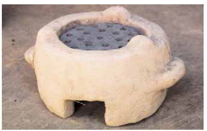
Honeycomb briquette in stove

BIOMASS BRIQUETTES: "HONEYCOMB" OR "BEEHIVE" VARIETY