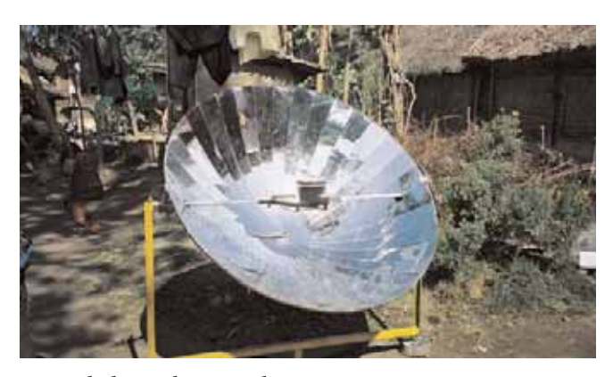
Parabolic cooker, Nepal

However, the parabolic cookers must be turned every 5 to 10 minutes to follow the most direct rays of the sun and to avoid burning, making the cooking process somewhat labor-intensive. They are very expensive, costing on average several