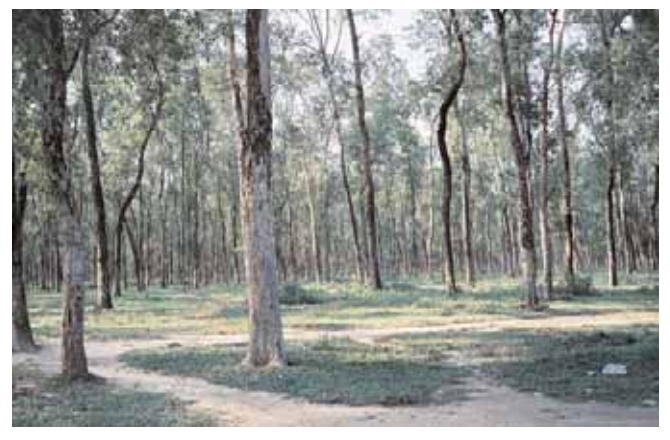
Forest outside Beldangi I camp, Nepal

Soon after the arrival of Bhutanese refugees in Nepal, UNHCR earmarked funding for forest protection and regeneration activities through its Refugee-Affected Areas Rehabilitation Program (RAAP). The RAAP was aimed in part at reducing the tensions between the local community and refugees that had resulted in an increasing number of attacks on refugees. Programs included fencing forests, replanting trees and rehabilitating forest infrastructure. The RAAP was run in collaboration with the Nepalese Ministry of Forestry, but expired in 2001 as UNHCR began scaling back its overall activities in the region.<sup>30</sup>