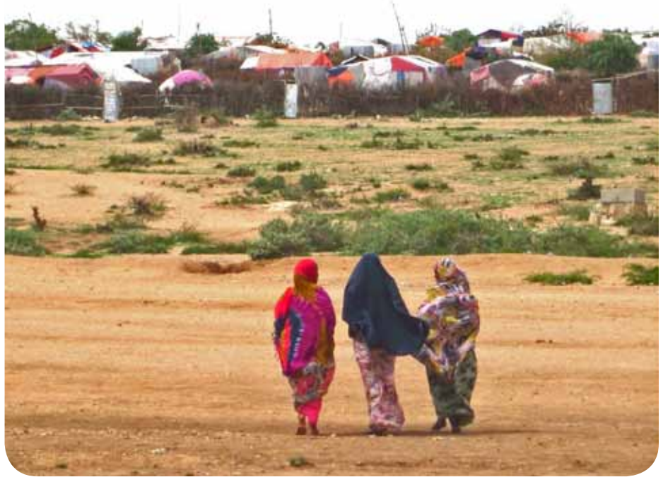
Young Somali women walk outside the refugee camp where they live. They say they fear harassment and attack by “hyenas, lions, snakes ... and men,” particularly when collecting water and firewood.

As of 2010, refugees in Sheder and Aw Barre officially had no access to land other than the small homestead