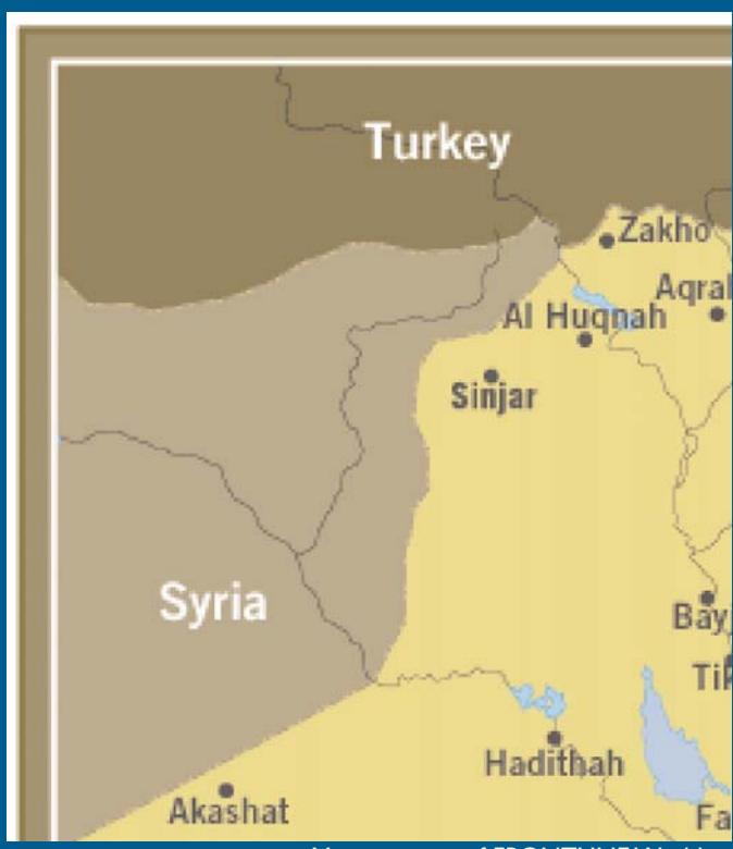
Map courtesy of FRONTLINE World

In the four years since the United States launched Operation Iraqi Freedom, violence against civilians in Iraq, including kidnappings, killings and car bombings, has become a daily occurrence. According to a study published in The Lancet, 655,000 excess deaths occurred in Iraq through the end of June 2006 because of the war.4 In addition, the political and sectarian violence has forced millions to flee in search of safety. Current estimates are that more than 4 million people have fled to other areas inside Iraq or to neighboring countries. An estimated additional 60,000<sup>5</sup> are displaced each month. According to the United Nations High Commissioner for Refugees (UNHCR), approximately one out of every eight Iragis has left their homes and an estimated 40 percent of Iraq's middle class, including professionals such as professors, doctors, teachers and engineers, is