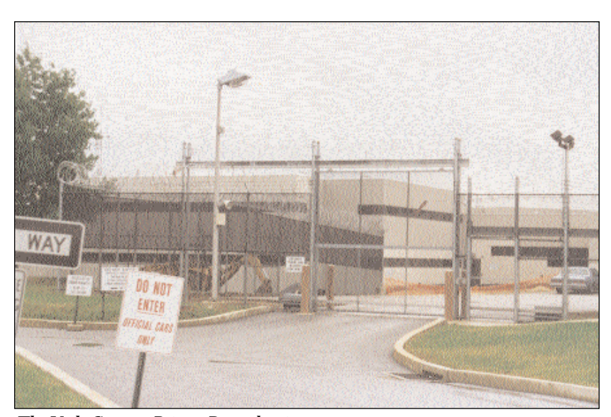
The York Country Prison, Pennsylvania

The following discussion highlights United States detention policy and the often disparate, but seldom appropriate, treatment that women asylum seekers receive in detention facilities across the country.