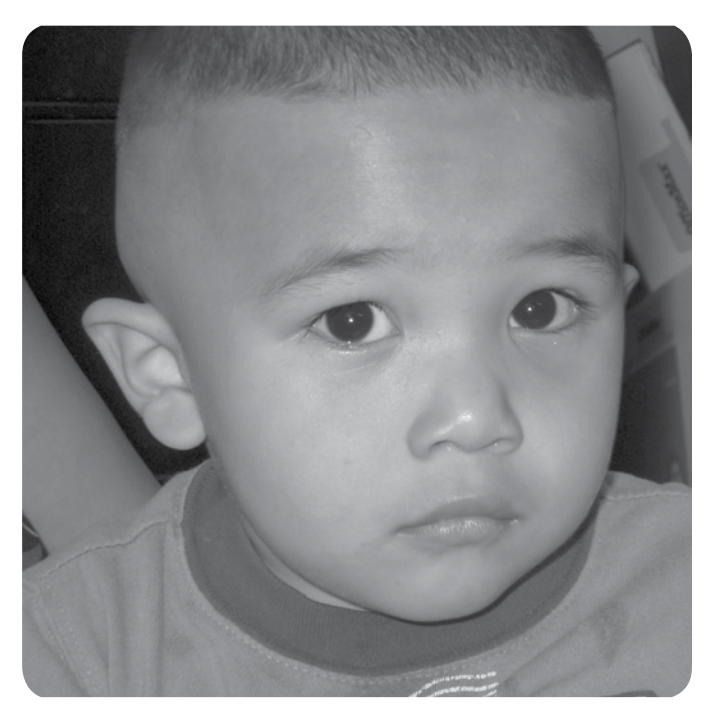
Children separated from parents who are in immigration detention or have been deported may end up in foster care or with unknown relatives.

In addition to undermining the well-being of children and families, the absence of clear and appropriate guidelines creates a lack of consistency and a great deal of confusion on the part of ICE agents. Some ICE agents use their discretion to not detain parents based on their concerns about children who may be left