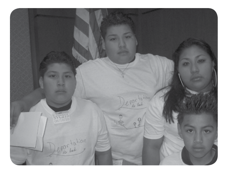
Countless children live with the trauma of separation from detained or deported immigrant parents.

unnecessarily vulnerable positions and can create de facto permanent separation. ICE has the capacity to arrange for family reunification prior to deportation, and can arrange for transportation of families on commercial carriers when necessary.