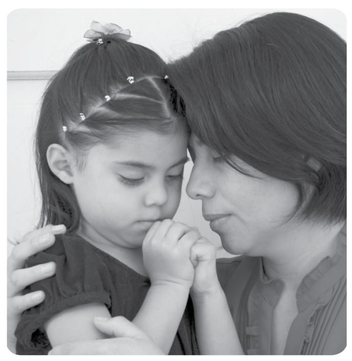
Immigrant mothers and their U.S. citizen children are often separated when parents are deported.

This report will focus on infringement on parental rights as a result of immigration enforcement, detention and deportation as well as on the collateral damage our current immigration practices cause for parents and children.<sup>21</sup> Our recommendations focus on preserving family unity—a founding principle of U.S. immigration