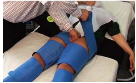
Non-pneumatic anti-shock garment.