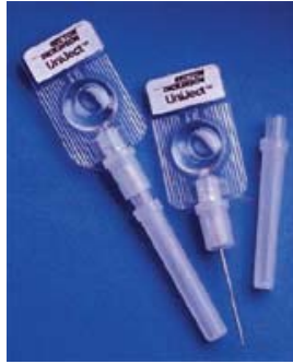
The Uniject autodisable injection device, developed by PATH, contains a single dose of vaccine and cannot be reused, which eliminates one route of disease transmission.