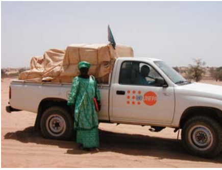
UNFPA delivers Interagency Emergency Health Kits.