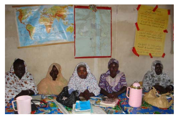
Teachers at the Government of Southern Sudan Girls School, Aweil Town. Only 14 percent of teachers in the south are women.

Poor working conditions make the retention of qualified teachers a challenge. Teachers in schools administered by the Government of Southern Sudan have only recently begun to receive compensation. The Women's Commission was told that teachers outside of town centers have yet to receive any payment at all for their service. Many teachers returning from Khartoum and Arabic-speaking garrison towns in the south also face challenges teaching in English, the new official language of Southern Sudan.