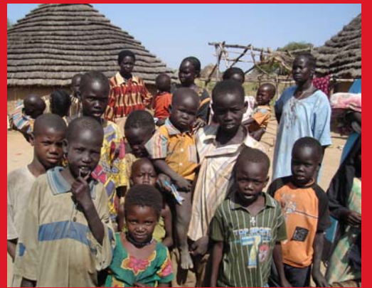
Internally displaced people returning to Southern Sudan have to rebuild their communities from

Oil Wealth - Oil revenues are to be shared on a 50:50 basis between the Khartoum Government and the SPLM/A.