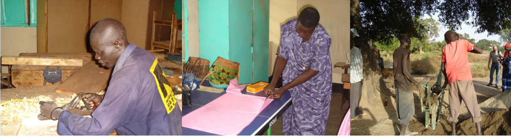
IRC and Ministry of Youth and Sports carpentry center.