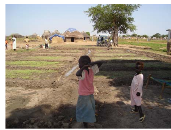
Members of an IRC-supported women in development and recovery group, Aweil Town.

An additional challenge will be ensuring that economic development includes ample opportunities for women to participate in revenue-generating activities. At present, local customs and laws provide some support for women's active participation in the formal economy. Some local jobs are almost exclusively held by women (such as bread baking and brewing alcoholic beverages), and others are commonly held by both men and women (such as market trade, farming and service sector jobs). By law, women have the right to own land, buildings and other property; however, by custom, many women do not enjoy equal rights to land ownership.<sup>56</sup> In addition, women are hampered from full participation in potentially higher-paying professions, such as teaching or the civil service, by obstacles to pursuing higher formal education or voca-