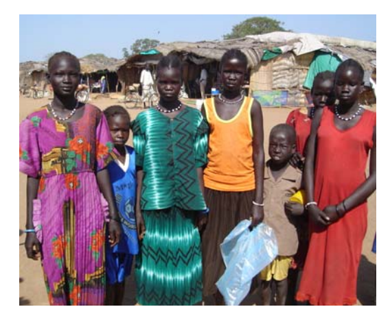
Youth such as these returnees face many risks and may miss out on opportunities to acquire knowledge and skills.

A few educational programs do exist to provide under-educated youth with useful knowledge and skills. The Women's Commission observed one such program in Northern Bahr-el-Ghazal, which provides 100 young people with vocational training in fields such as carpentry and tailoring, numeracy and literacy instruction, and life skills education. This is the only vocational training program in Southern Sudan's most populous state. While the program represents a step in the right direction, it is hardly adequate to serve the