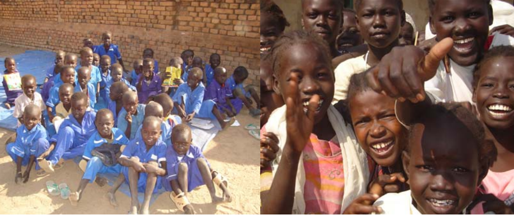
Comboni mixed primary and secondary school in Aweil Town.