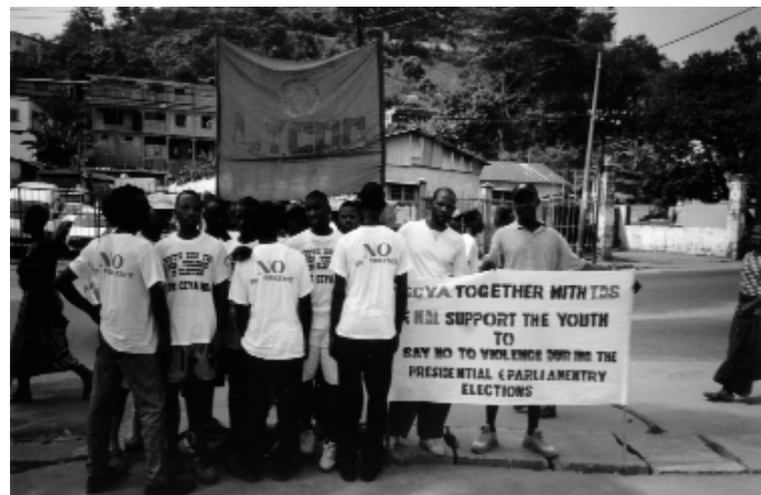
Young people want to move beyond marginalization to real participation in society. Here they came together to support non-violence among youth during the May 2002 presidential and parliamentary elections.

The consequences of this exploitation are deep and