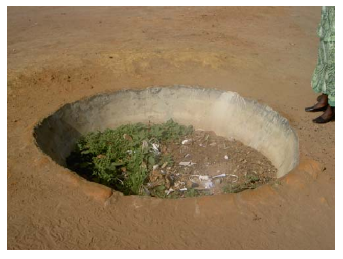
Unfenced medical waste pit, Health Centre II, Omot IDP camp.

The practice of infection control by health workers in health facilities was reported by the MoH and observed to be very poor. In the observed Kitgum health facilities, which were all supported by international NGOs, supplies such as needles, syringes and gloves were available but not in abundance, and health workers expressed concern they would run out of these supplies. Disposal systems such as boxes for sharp materials, incinerators to burn sharps and fenced-off waste pits were established, though in one setting the system had broken. There were autoclaves in the health facilities but not a consistent supply of charcoal or paraffin to use them. In addition, there were no written instructions on how to use the autoclaves.