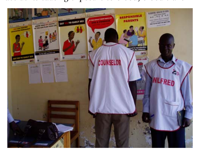
Gulu Youth Center Counselors.

Focus group participants were very aware and knowledgeable about HIV/AIDS with a few misconceptions. Male focus group participants in Padibe camp said AIDS is common, not curable and kills. Women in this camp said that many people in the community had become sick from AIDS and died. These women blamed the problem on men because they have many partners and women are unable to refuse sex. Most participants could describe what causes the transmission of HIV (sex, accidents causing exposure to blood, blood trans-