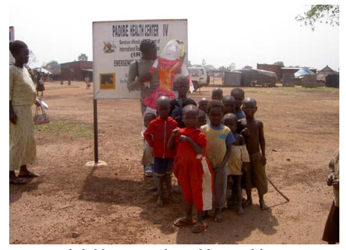
Group of children outside Padibe Health Centre IV.

According to current indicators the level of RH in northern Uganda has fallen dramatically below national averages. A recent United Nations Population Fund (UNFPA) assessment highlights the fact that many of the international NGOs and agencies providing health care in the camps have limited sexual and RH programs.<sup>30</sup> The programs