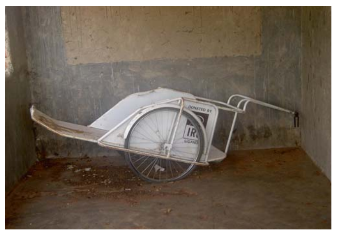
Non-functioning bicycle ambulance: it has a flat tire and the bicycle is gone. It is only used to move dead bodies and supplies. Omot IDP camp, Health Centre II.

Focus group participants in Kitgum and Pader districts report that they transport women from home by bicycle—with a stretcher attached if available—to health facilities. Health workers in Kitgum and Pader districts refer women suffering from complications of pregnancy and delivery to the Kitgum and Patong hospitals, respectively. In one setting an NGO provided a mobile telephone to the clinic and in another the clinical officer uses his own mobile telephone to call an ambulance. However, the ambulance will not travel to at least one setting at night due to security issues. In addition, in one of two settings, vital medications such as oxytocic drugs to prevent hemorrhage and magnesium sulphate for seizures were not available to stabilize a