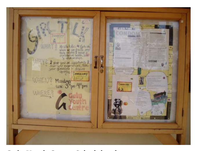
Gulu Youth Center Schedule of current events.

Young school girls participating in a focus group in Omot camp said that soldiers approach them wanting sex and will attack them if they refuse. In addition, girls are at risk of sexual violence from boys who do not go to school. They said that girls who are raped are taken to the hospital for med-