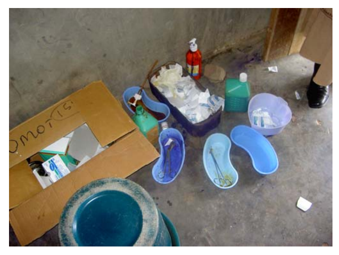
Dressing room at Omot IDP camp HC II. All equipment and instruments are kept and cleaned in kidney dishes on the floor as the room does not have a table.

In one facility the health worker was knowledgeable about how to use the autoclave, yet in another the health worker did not understand the protocol for its use. Adequate water tanks were available in one facility, but not in another. Soap was generally available.