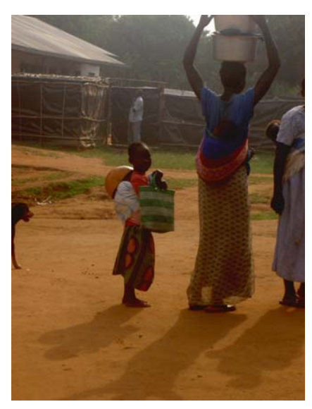
Women returning from the market. Like her elders, the little girl is carrying a small baby on her back, protected from the sun by half a calabash shell, Mucwini camp.

pants wanted access to birth control. Contraceptive methods were available at the health facility in Mucwini camp but women were not aware they were available. Although some women said they still wanted up to six children, they also mentioned that they would have wanted more before the war and that it was too difficult now. Most female focus group participants could identify contraceptive methods such as injection (Depo Provera), pills, condoms and Norplant. The overwhelming majority of focus group participants were not aware of emergency contraception (EC). Some of the female focus group participants had never heard of female condoms while others had and were interested in trying them. Focus group participants said that there was a real need for general sensitization, particularly married men, on family planning in the camps and suggested going house to house to discuss the issue because very few are practicing.