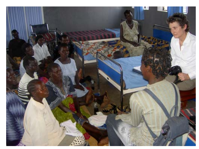
Focus group discussion with Ante-Natal Care Clients, Padibe Maternity Unit.

Health workers reported that partners of pregnant women do not come for VCT. Men consider that getting tested and dealing with the risks of HIV/ AIDS for pregnant women is a woman's problem.