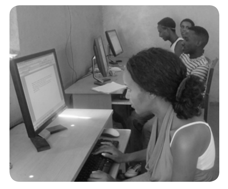
Computer classes are highly sought after.

Examples used to illustrate these three strategies were synthesized from the field assessment findings and recommendations and a desk review of programs.