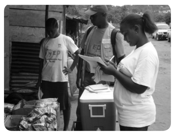
Youth participants of the Norwegian Refugee Council's Youth Education Pack program in Liberia practice the "Market Observation" exercise of the Market Assessment Toolkit of the Women's Refugee Commission and Columbia University (2008).