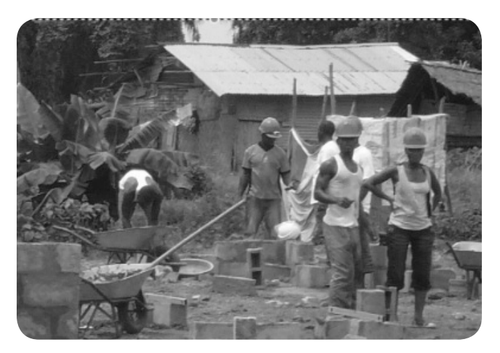
Young women and men participate in a construction project in Liberia.

Conflict-affected, displaced youth must often work to provide for their basic needs, often in unsafe situations. Our findings confirmed that displaced youth are economically active and contribute to multiple household livelihood strategies across displacement contexts, although paid work opportunities are particularly constrained in camp-based settings. Some camp-based young men living close to villages or towns in stable areas at times find work in manual labor, such as working in construction, transporting heavy loads of goods, herding animals or assisting in markets. Young women in camps near villages or towns sometimes work for low pay cleaning homes or washing laundry. Poorly