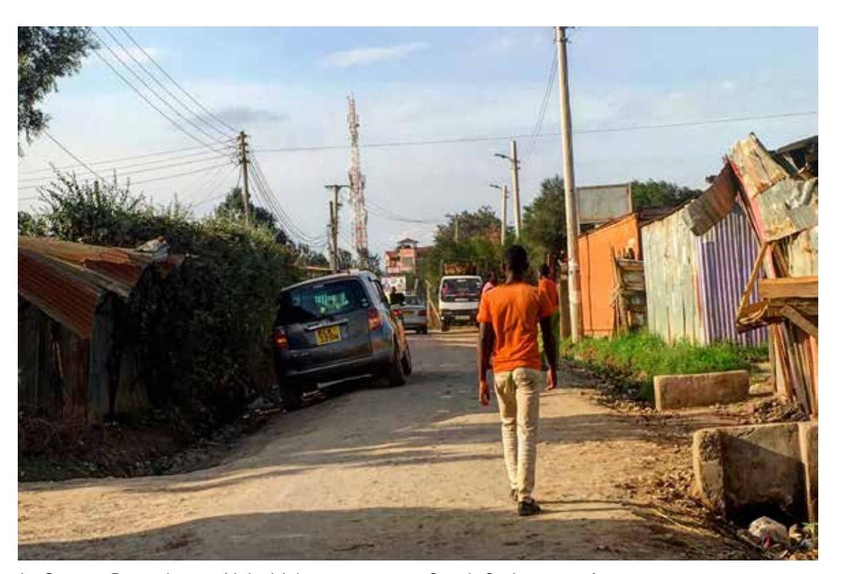
In Ongata Rongai, near Nairobi, home to many South Sudanese refugees.

More services were available in Nairobi, where an informal referral network had been established for male refugee survivors and refugee survivors with diverse SOGIESC. In the other settings, functioning referral systems were either not established (i.e., in Rome, Sicily, and Mombasa) or male survivors and survivors with diverse SOGIESC were not sufficiently integrated into existing networks (i.e., in Cox's Bazar.)