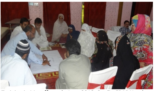
Training in Muzaffargarh, June 2018.

During the community trainings, participants developed action plans for their respective UCs that aimed to address gaps to implement the MISP for SRH. Communities then spent 1.5 years implementing their action plans to strengthen their capacity to respond to SRH needs in emergencies. Rahnuma-FPAP followed up with trainees every two months; developed information, education, and communication (IEC) materials; mentored trainees; and monitored the implementation of action plans.