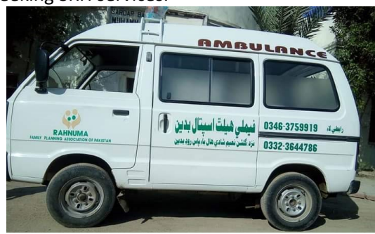
FPAP ambulance, Badin District.