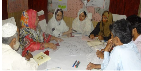
Community session in Muzaffargarh District.